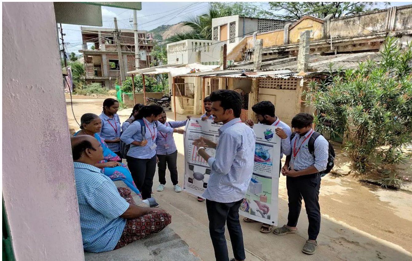
An Outreach program "Water Conservation Tips and Techniques to Rural Villages"

The Photographs of the event are as follows: