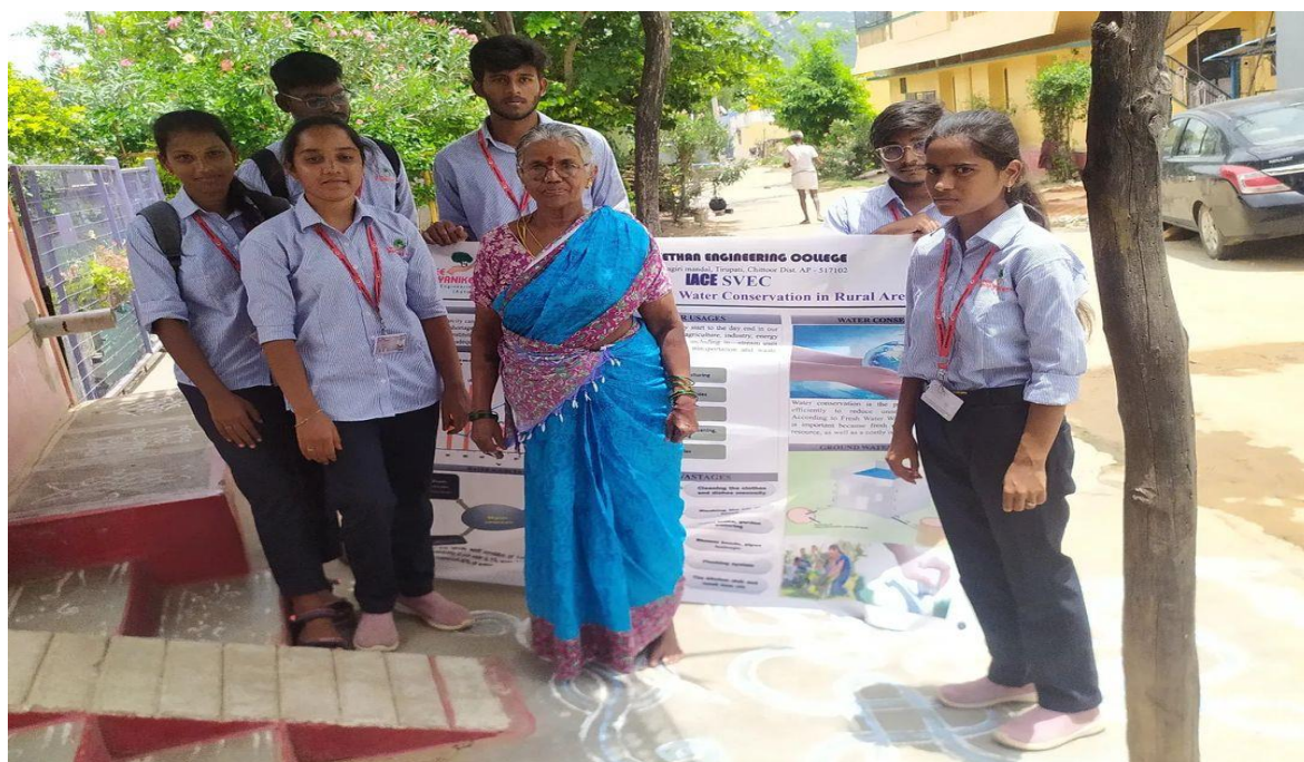
An Outreach program "Water Conservation Tips and Techniques to Rural Villages"