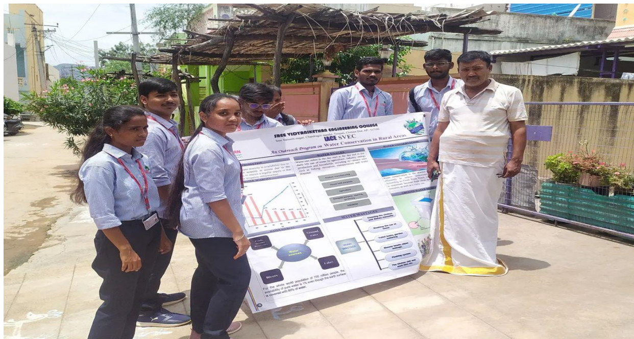
An Outreach program "Water Conservation Tips and Techniques to Rural Villages"