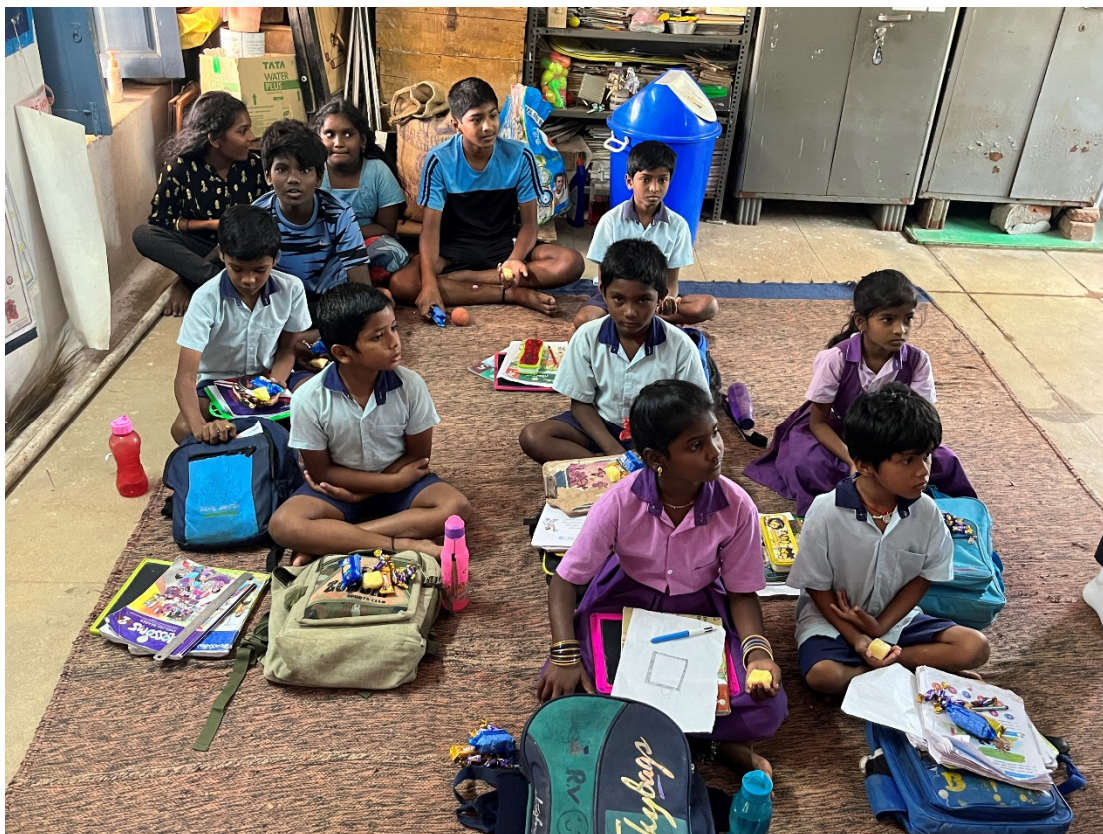
ASCE SVEC Student Chapter Office Bearers of Civil Engineering Department interacting the children during Visit to “Bandarlapalli Aganwadi Centre & Pre-Primary School”, Bandarlapalli (V), Chandragiri (M), Tirupati District, A.P, India