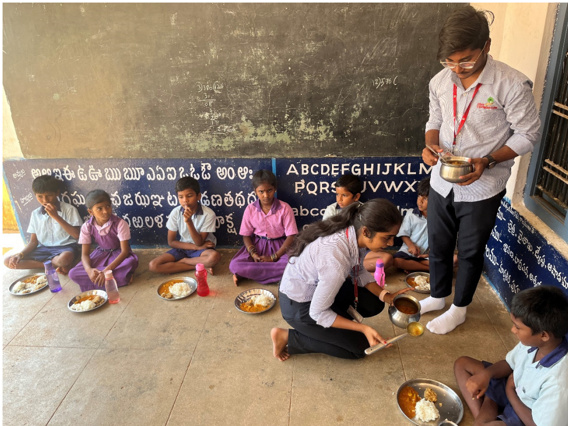
ASCE SVEC Student Chapter Office Bearers of Civil Engineering Department - Visit to "Bandarlapalli Aganwadi Centre & Pre-Primary School", Bandarlapalli (V), Chandragiri (M), Tirupati District, A.P, India