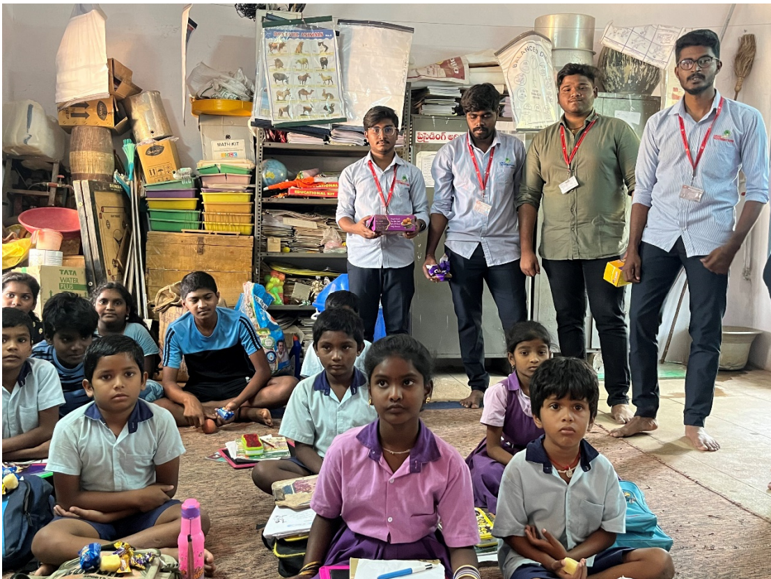
ASCE SVEC Student Chapter Office Bearers of Civil Engineering Department - Visit to "Bandarlapalli Aganwadi Centre & Pre-Primary School", Bandarlapalli (V), Chandragiri Mandal, Tirupati District, A.P, India