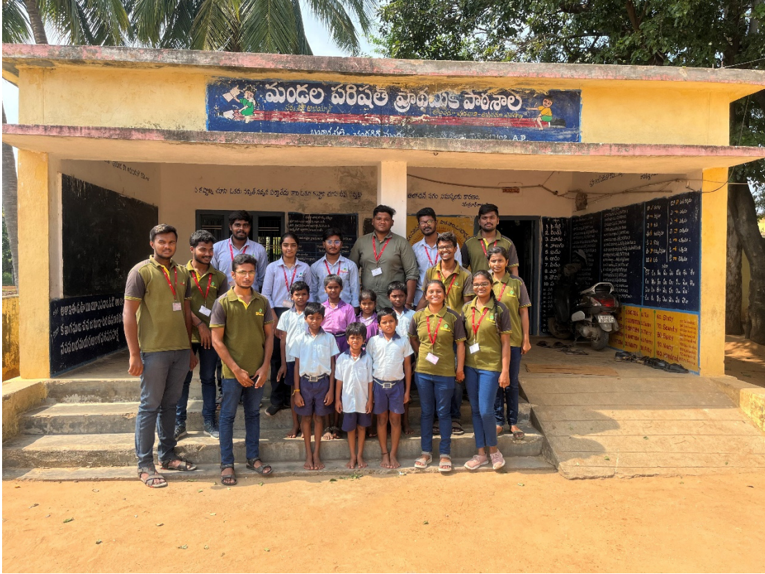
Group Photograph during the Visit to “Bandarlapalli Aganwadi Centre & Pre-Primary School”, Bandarlapalli (V), Chandragiri Mandal, Tirupati District, A.P, India