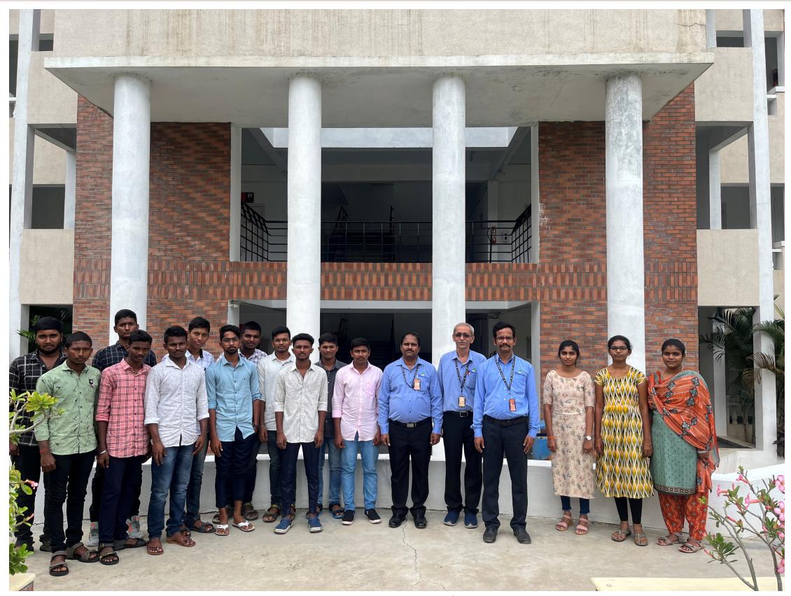
A Group Photograph of the Event