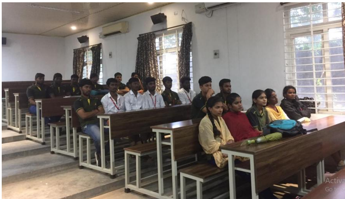
Students and Faculty Members Attending the Lecture in Civil Seminar Hall

The following feedback was received from the participants: