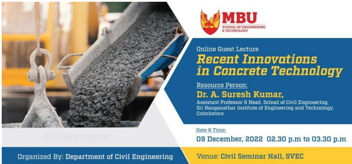
Banner of the Guest Lecture