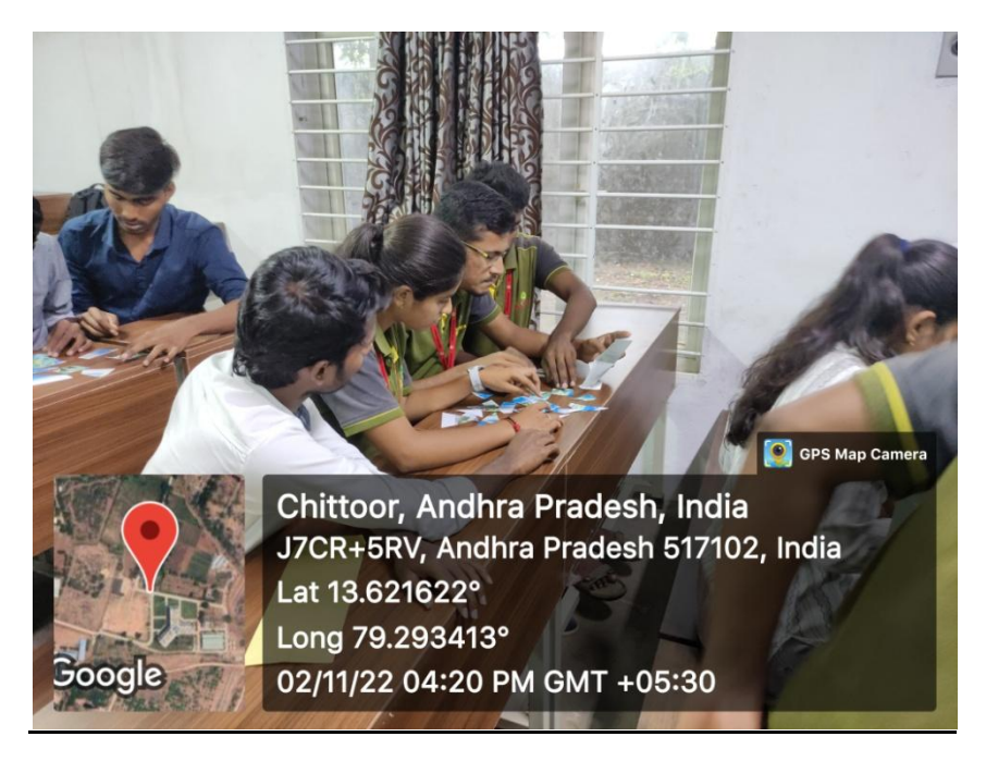
Participants arranging the cuttings to finish the puzzle