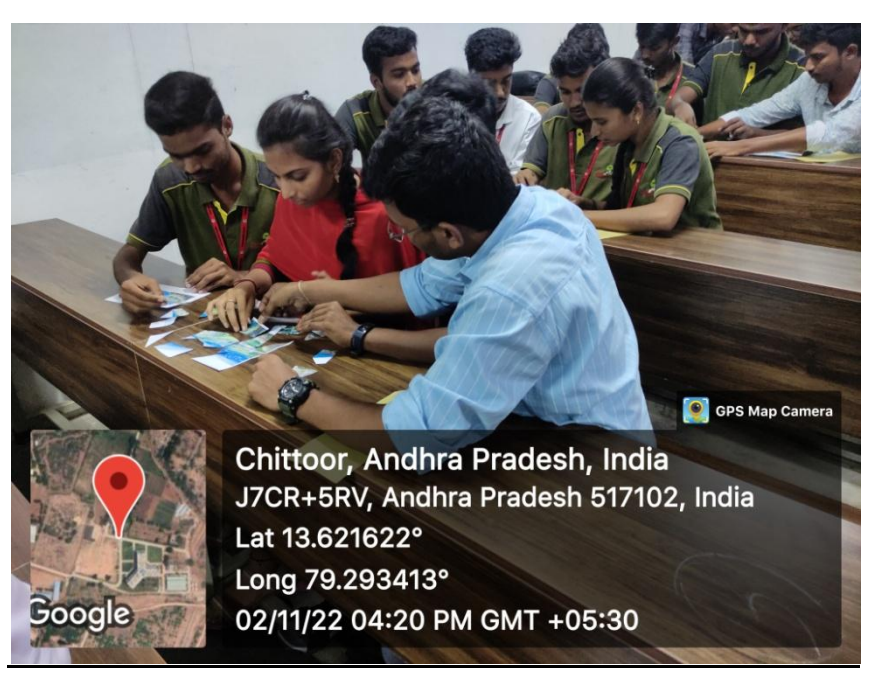
Participants arranging the cuttings to finish the puzzle

The photographs of the event are as follows: