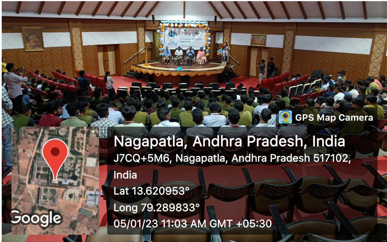
Inauguration of Geotechnical Fiesta'22 Valedictory Function