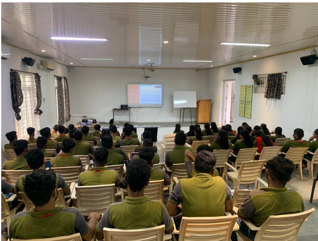
Students Attending the Lecture in Civil Seminar Hall