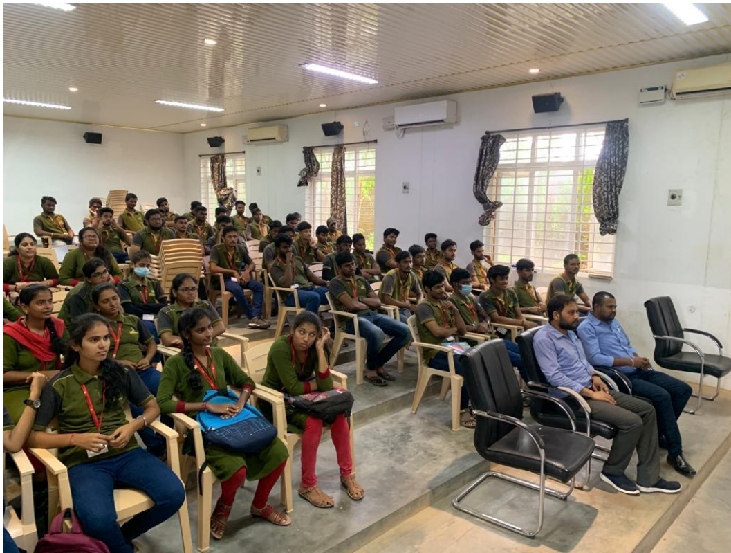
Students and Faculty Members Attending the Lecture in Civil Seminar Hall