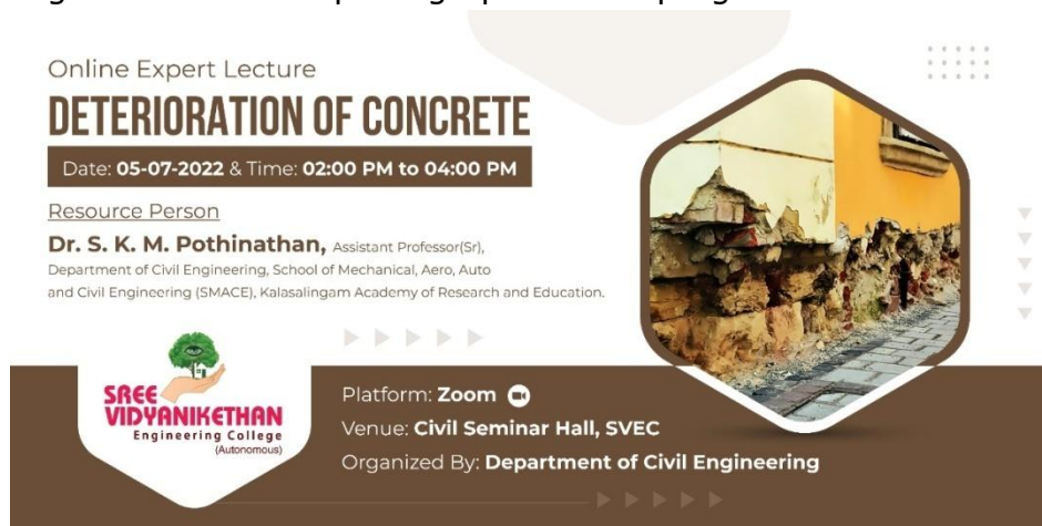
Program Details of the Guest Lecture

The program details and photographs of the program are as follows.