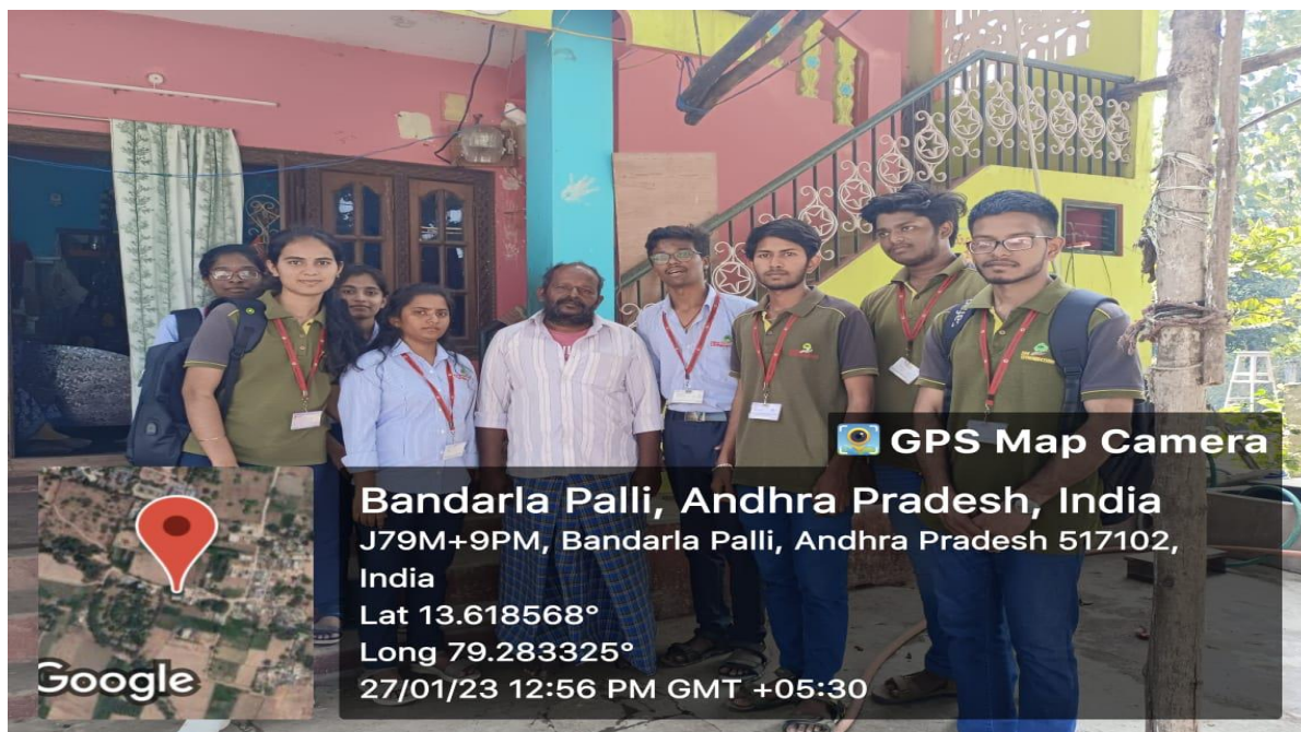
B.Tech. CE Students with villagers