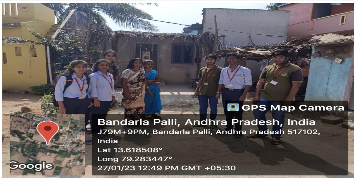
An Outreach program on “Electricity Conservation in Rural Villages”