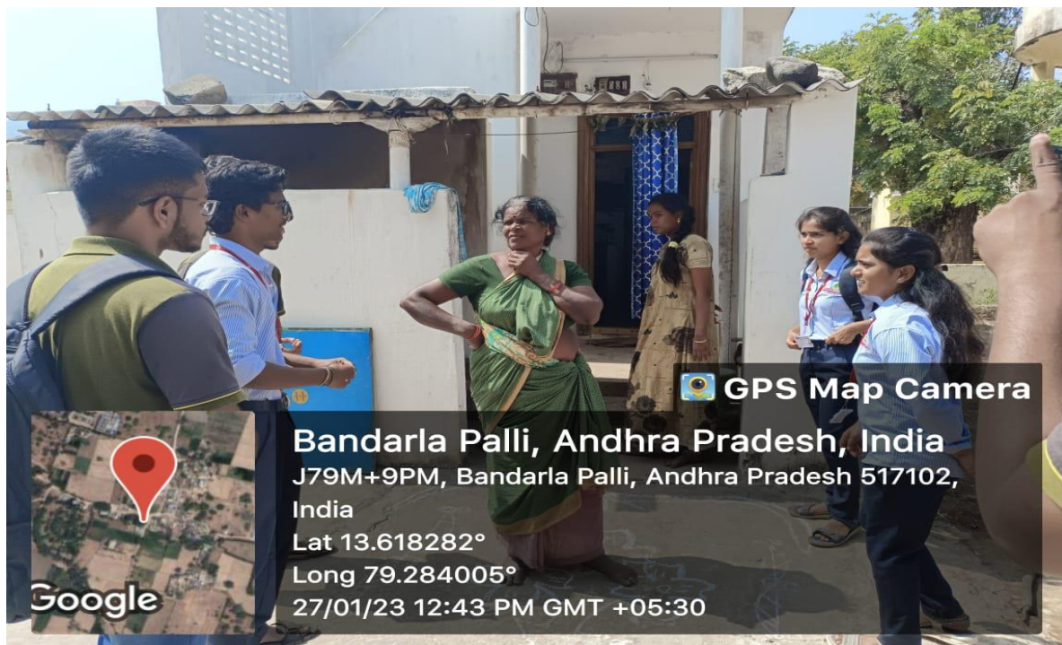
B.Tech. CE Students with villagers