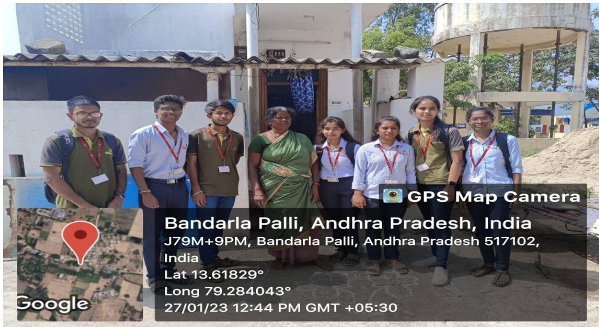
An Outreach program on "Electricity Conservation in Rural Villages"