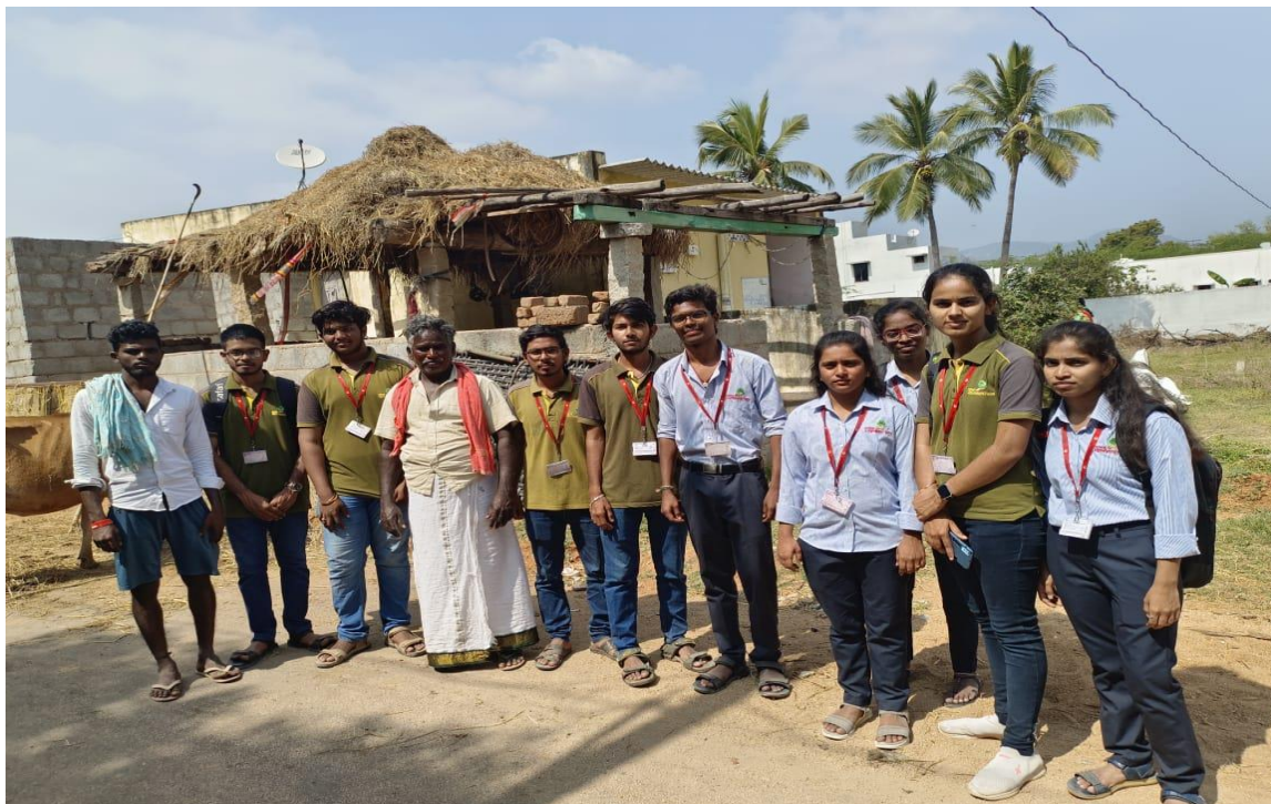
An Outreach program on “Electricity Conservation in Rural Villages”

The Photographs of the event are as follows: