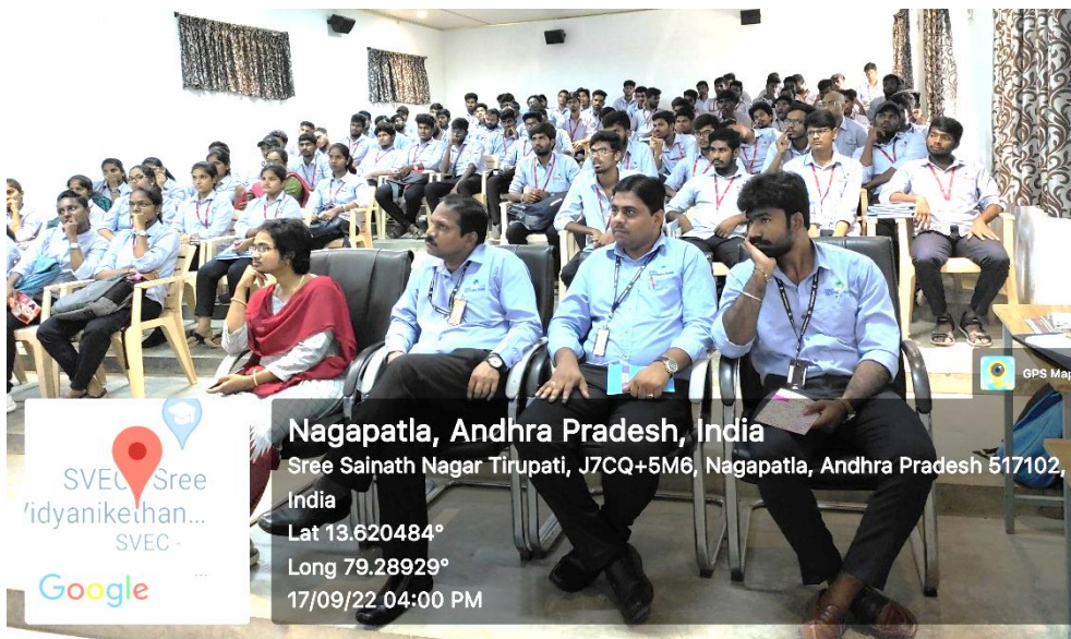
Faculty and Students of Civil Engineering listening to the Expert Lecture