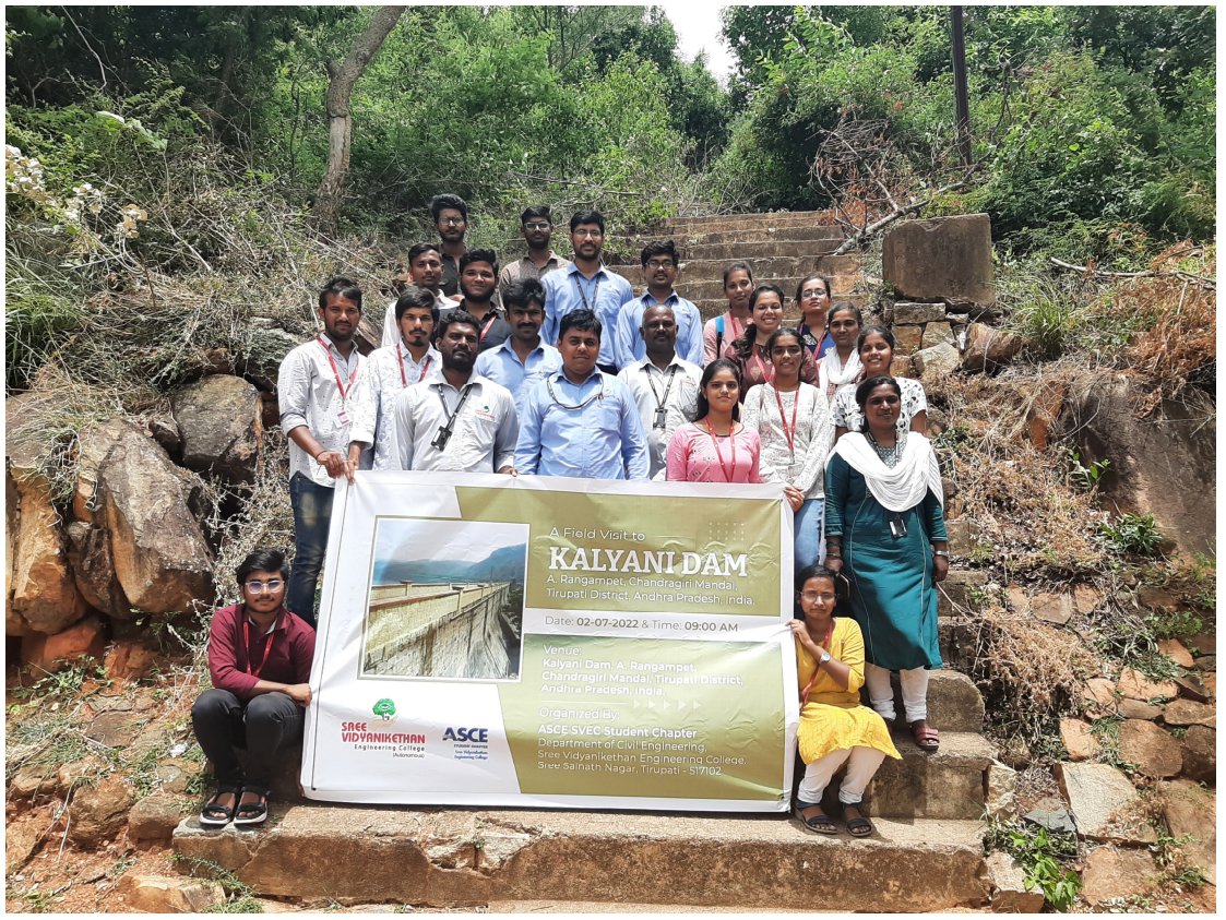
Group Photograph of Faculty and ASCE Office Bearers-2022 at Kalyani Dam, A. Rangampet, Chandragiri Mandal, Tirupati District, Andhra Pradesh, India