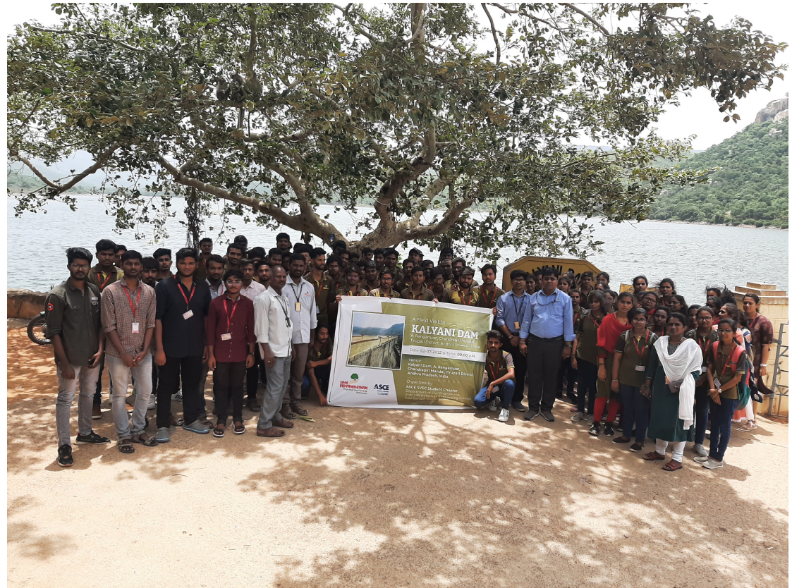
Group Photograph of Faculty and Students at Kalyani Dam, A. Rangampet, Chandragiri Mandal, Tirupati District, Andhra Pradesh, India