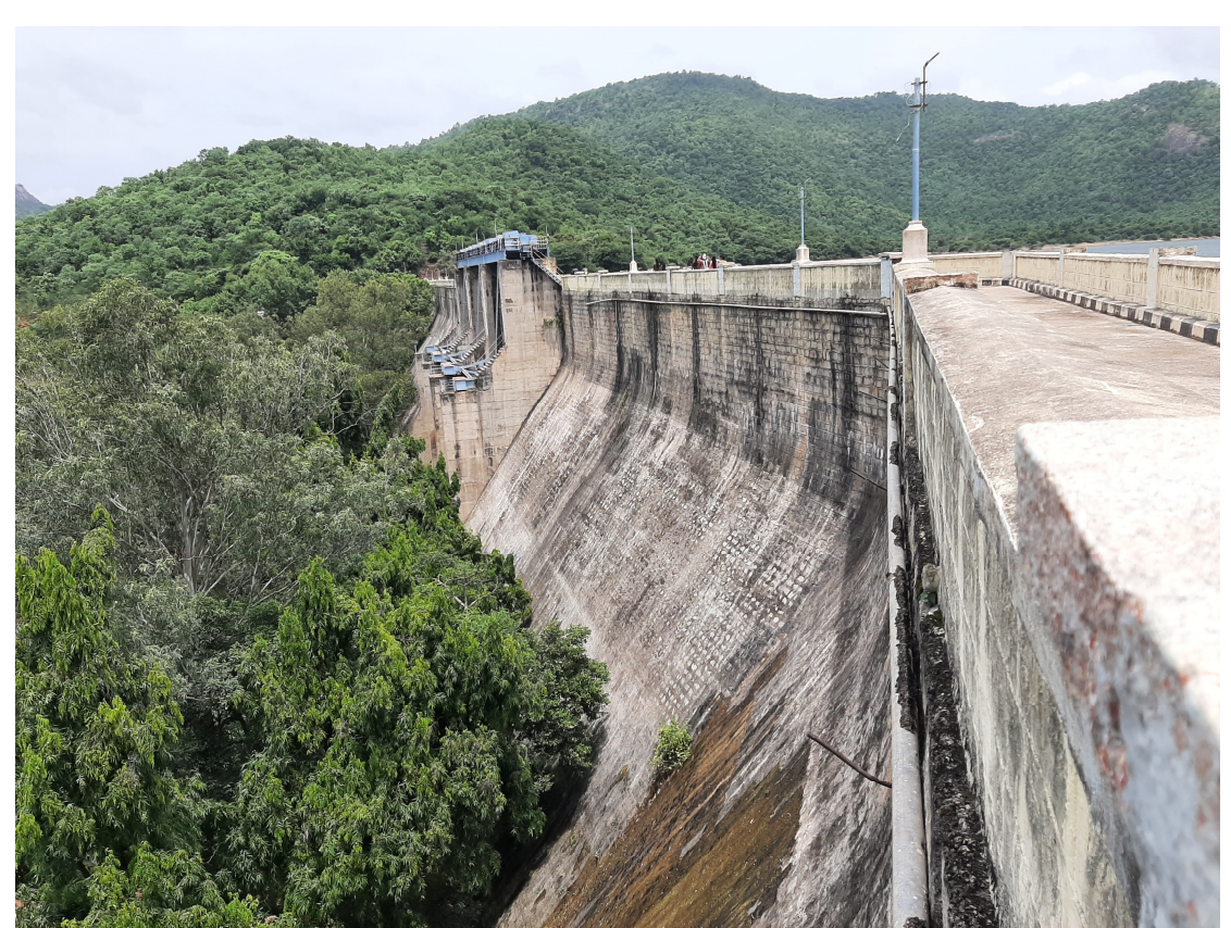
Photograph of Kalyani Dam, A. Rangampet, Chandragiri Mandal, Tirupati District, Andhra Pradesh, India