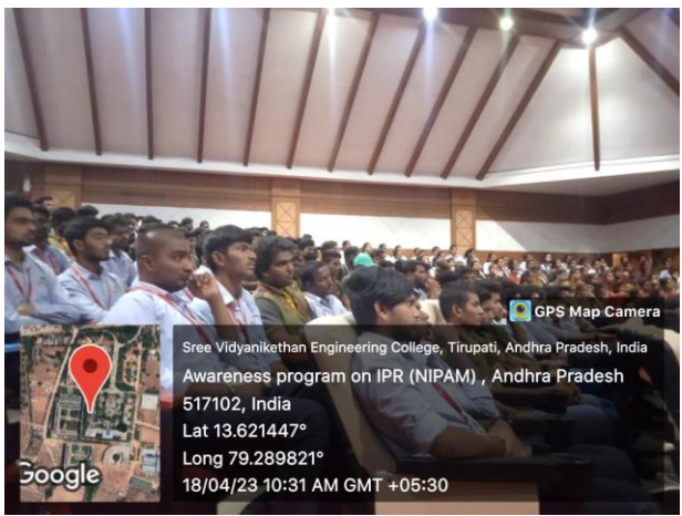
A portion of participants listening to the lecture