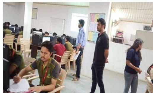
Students performing Experiments in Virtual Labs