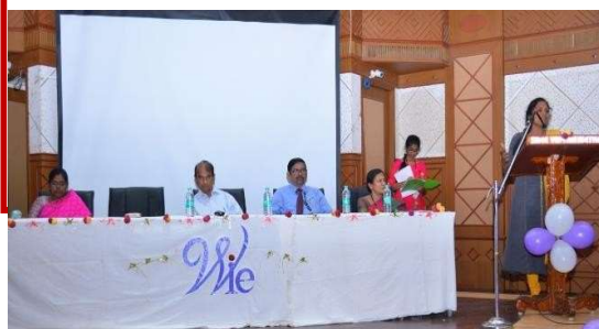
Inauguration of IEEE women in engineering (WIE) affinity group