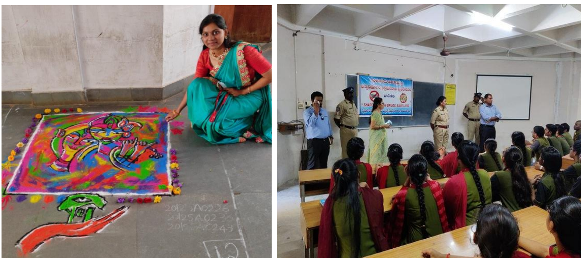
Fig: Students taking active part in extra-curricular events

Technical Activities like Technical quiz, Mock Interviews and extracurricular events like Mythology quiz, singing competition, General quiz, Pencil sketch, Debate, Anti-drug Awareness workshop, Rangoli, switch to conserve were conducted to open students mind to new interests and views.