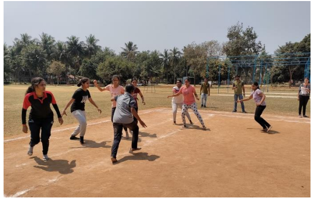
Fig: Students competing in ETA sports

ETA valedictory is conducted every year to share their views regarding Electrical Technical Association. Students are honored with prizes to boost their self-esteem.