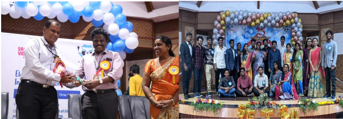
Fig: Celebrating ETA inaugural and valedictory functions

ETA valedictory is conducted every year to share their views regarding Electrical Technical Association. Students are honored with prizes to boost their self-esteem.