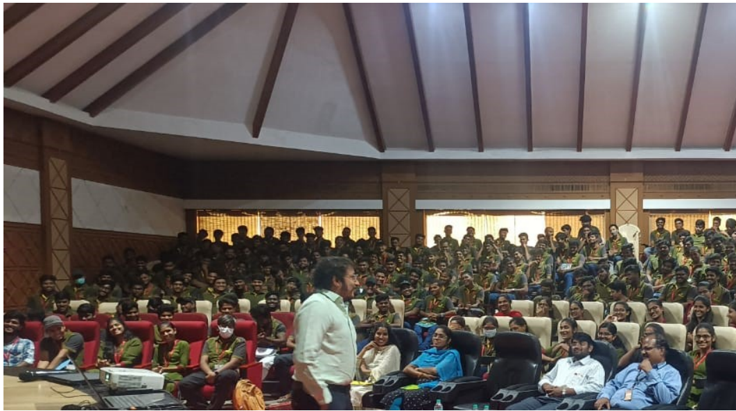
Fig.2: Students are lessoning the various opportunities to set their career through competitive exams

Students were listening to the session actively to learn about various Competitive exams. Session went very well he has explained the recent statistics of job skills in market. Statistics of domain talent pool and ratio of hiring industry talent skills.