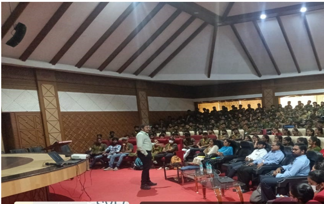
Fig.3: Question and answer section with II B.Tech II sem students (GEO Tag Photo)

Students were listening to the session actively to learn about various Competitive exams. Session went very well he has explained the recent statistics of job skills in market. Statistics of domain talent pool and ratio of hiring industry talent skills.