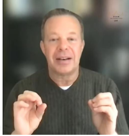
Dr. Joe Dispenza, Neuroscientist expressing his views on healing through Peace

The program concluded with a magnificent meditation led by speaker Sri Krishnaji. He lead over participants into inner peace and made them radiate peace energies to every nation that is gripped by conflict and war. The meditation dissolved anger and hate and opened hearts to peace.