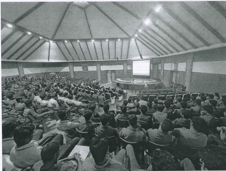
Students participation during the program