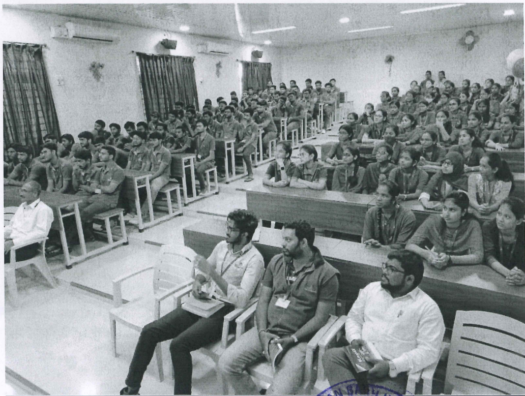
Students attended the sessions during the program