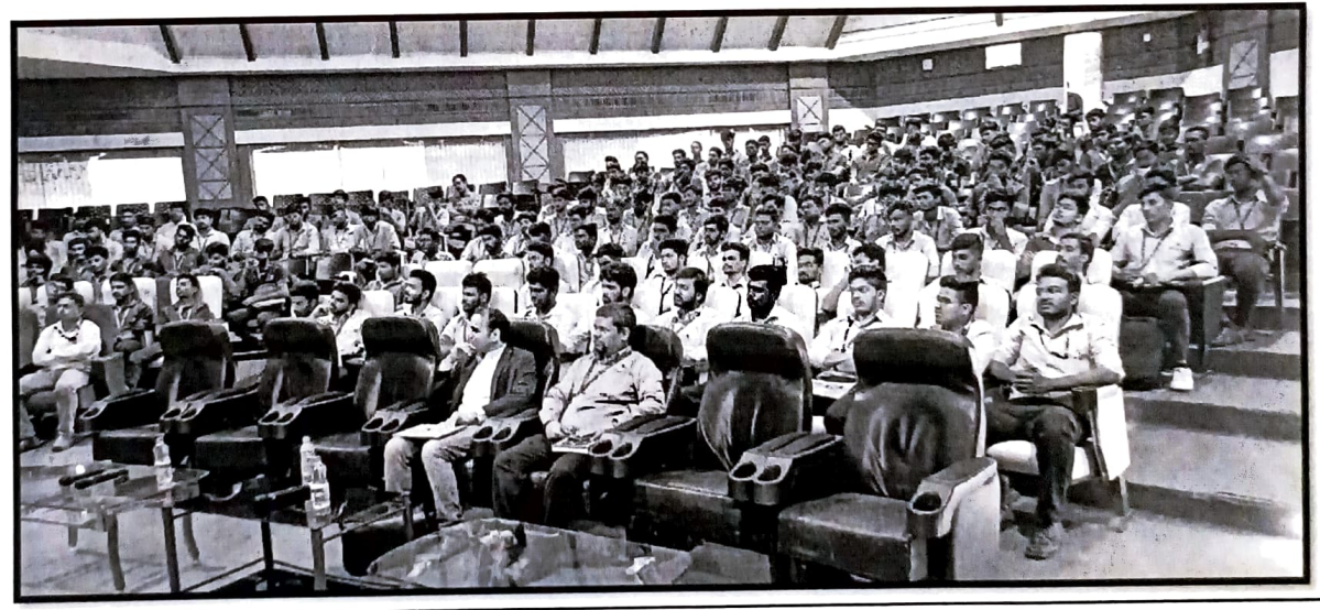
Students attended the program

COORDINATOR Entrepreneurship Dovelopment Cell MOHAN BABU UNIVERSITY Sree Sainath Nagar, A.Rangampet TIRUPATI - 517 102