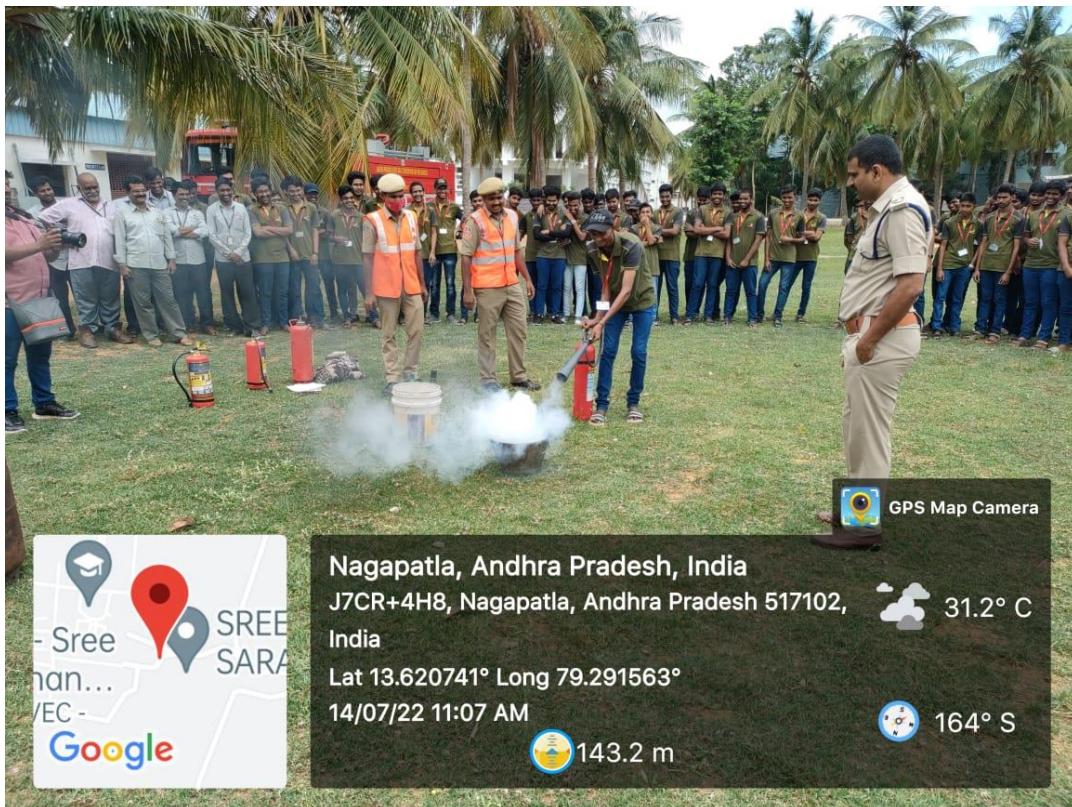
NSS Volunteer is performing the activity on controlling the fire hazards.