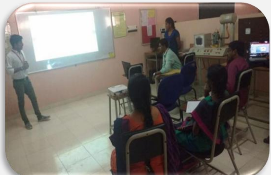
Technical Paper Presentation

During the AY: 2017-18, Total 16 events were conducted under ETA.