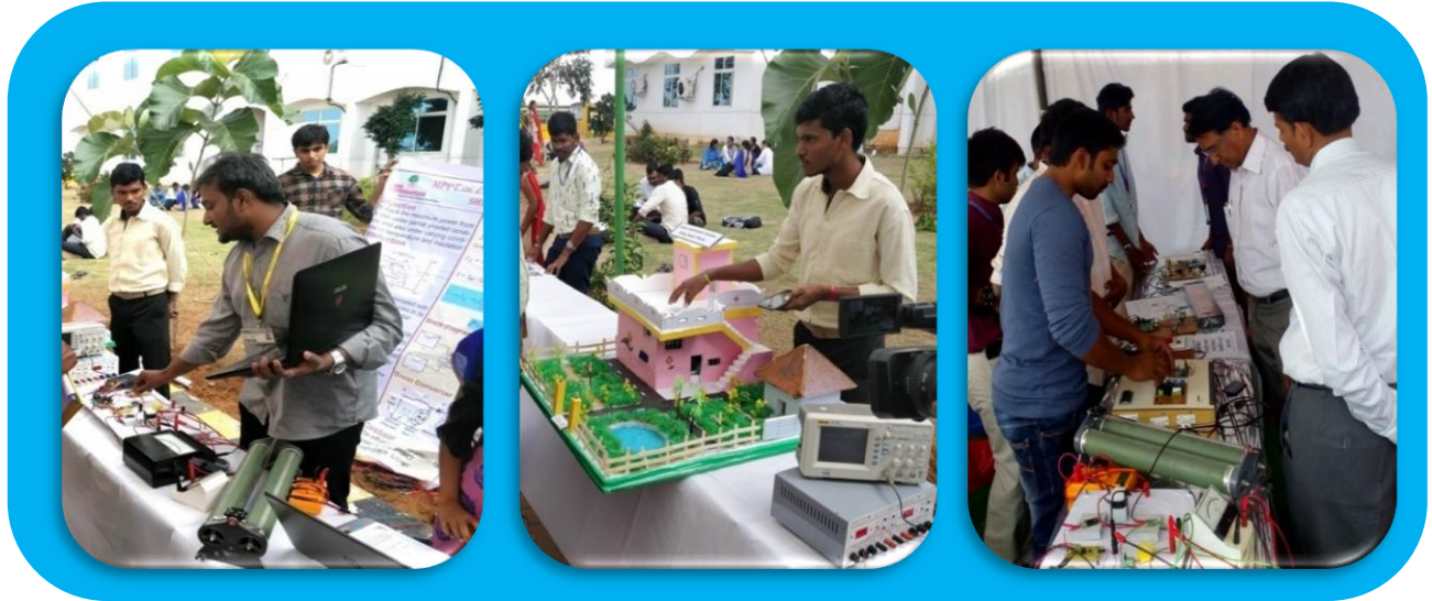
JNTUA Tech Fest, 2018