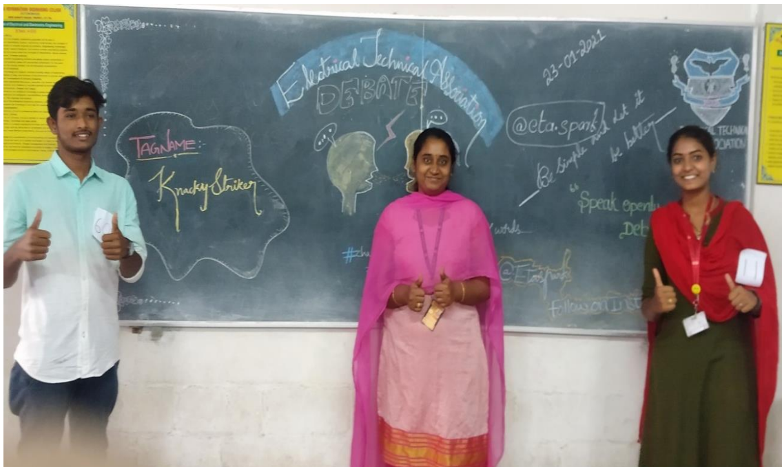
Fig.: Appreciating winner and runner of debate event.

The Electrical Technical Association holds the responsibility in enhancing technical knowledge in the field of Electrical Engineering, boosting the confidence levels of students, and inculcating morals and ethical values for wholesome development of oneself. This year, an overall of 14 events were conducted. A total of 803 students had participated and 36 students bagged prizes.