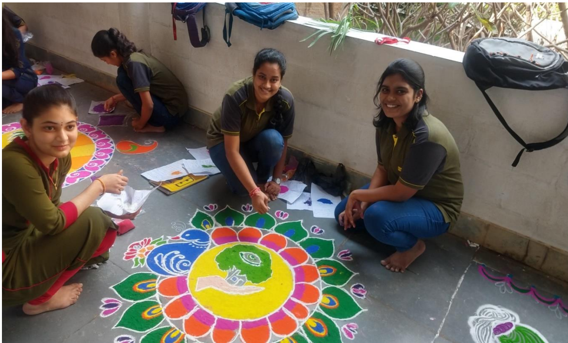
Fig: Students actively participating in rangoli competition

This year, an “Add-on course on aurdino” was conducted. This program was conducted to enhance thinking and analytic skills of our students. It also helps to make interactive objects quickly and easily for their engineering projects. Another new program “Poster making”, it is obvious that posters can have quite a positive effect on the process of learning. This event helps students to visually represent the key points and while presenting elaborate on the same which facilitates their retention and recall of events and facts. The best advantage of poster making event is that it facilitates team work and understanding along with facilitating creative thinking.