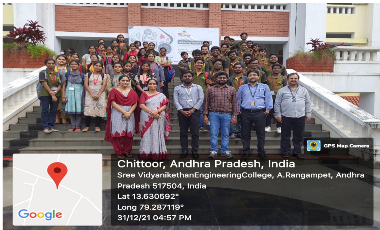
Group photo with HOD-IT, Resource Person, Program Coordinators and Participants