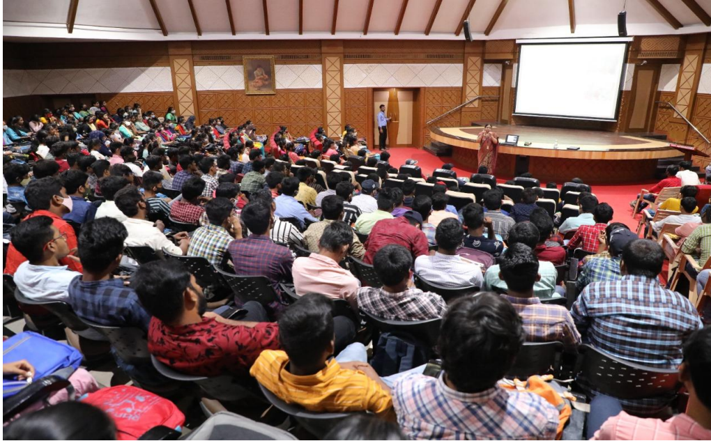
Gathering at Dasari Auditorium for the Session