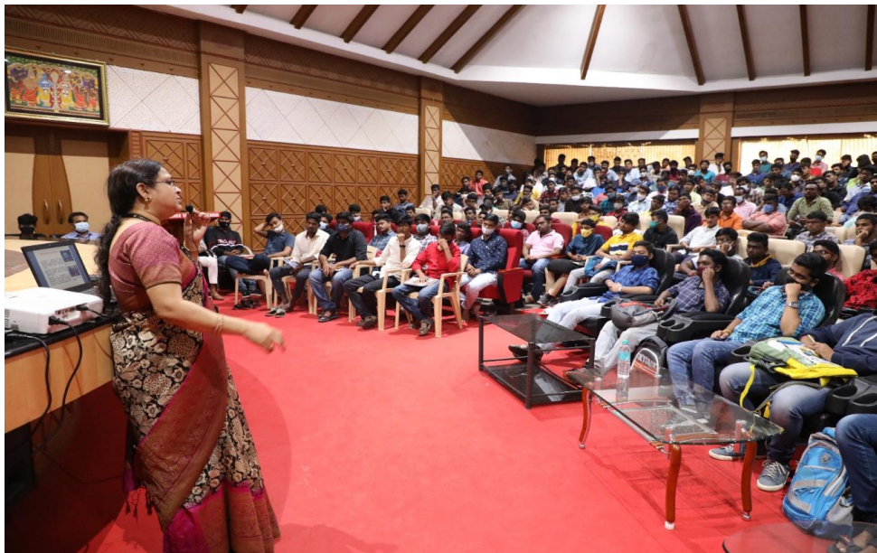
Students Interaction with the Speaker