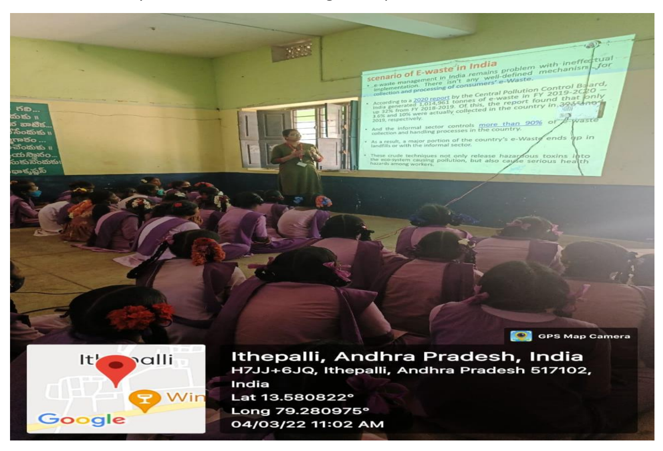
Student Volunteer Explaining and cresting awareness on handling e-waste