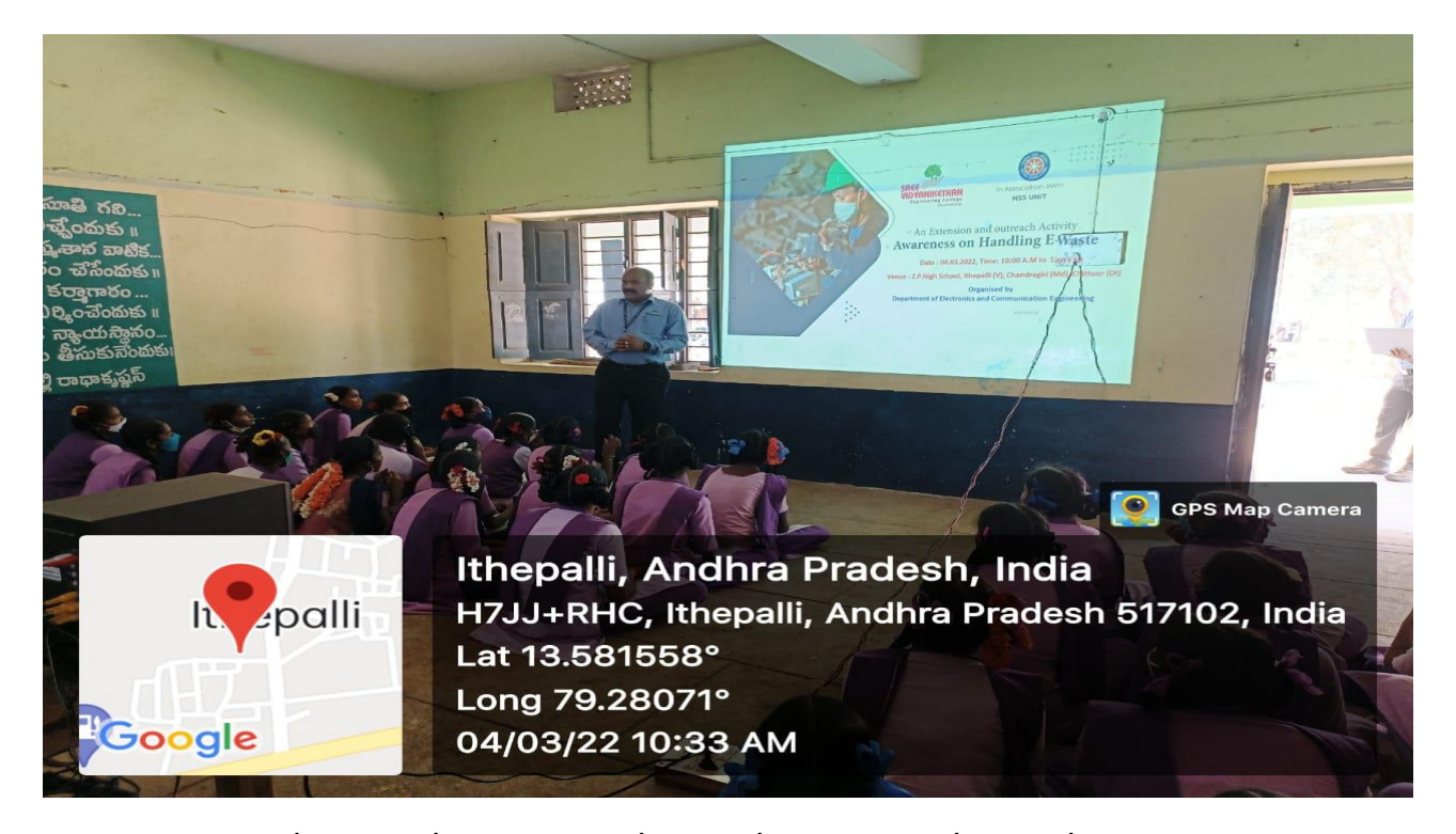
Faculty Coordinator introducing the topic to the Students