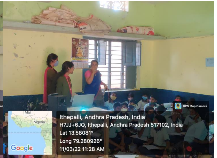
Coordinators and students interaction the students