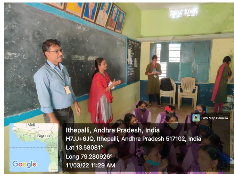
Faculty Addressing the students regarding the available opportunities.