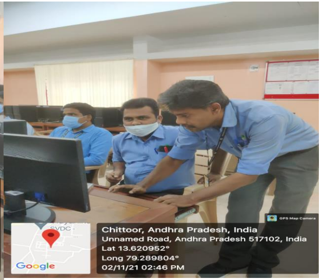
Participants creating their own course on CANVAS