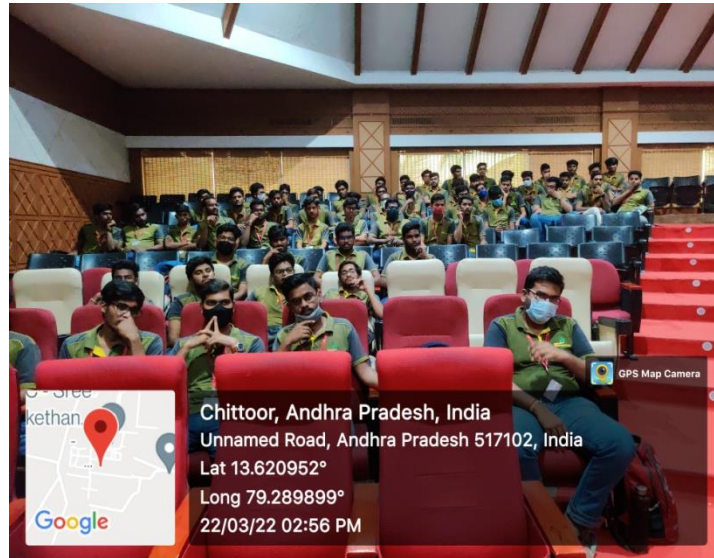
Participants Interpreting the Veda Guidelines for being an idle Entrepreneurs