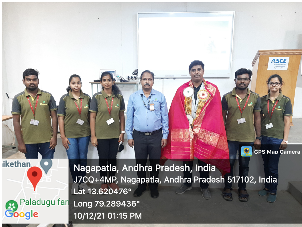
A Group Photograph at the Event