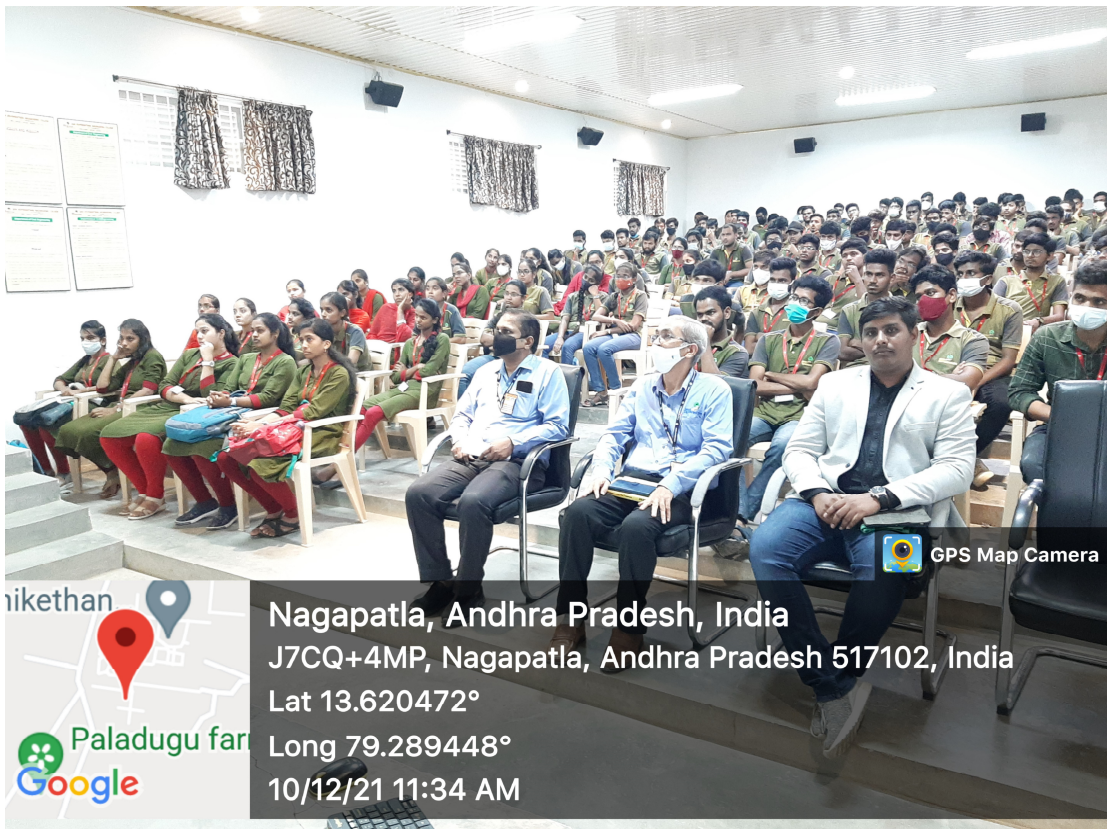
Students and Faculty Listening to the Guest Speaker Profile