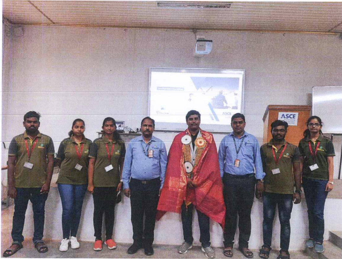
A Group Photograph at the Event