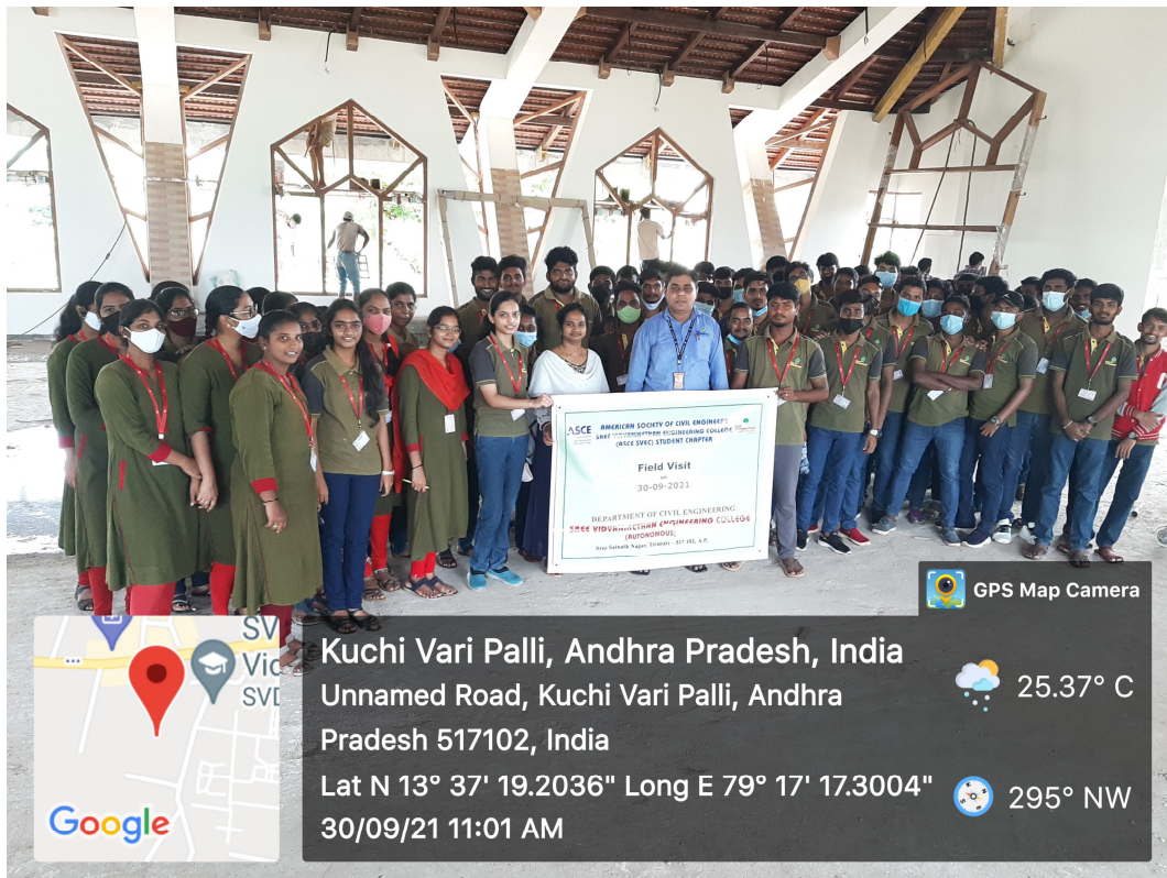
A Group Photograph at Construction Site Inside Sri Shirdi Sai Baba Temple Building, Besides SVEC Campus, A. Rangampet