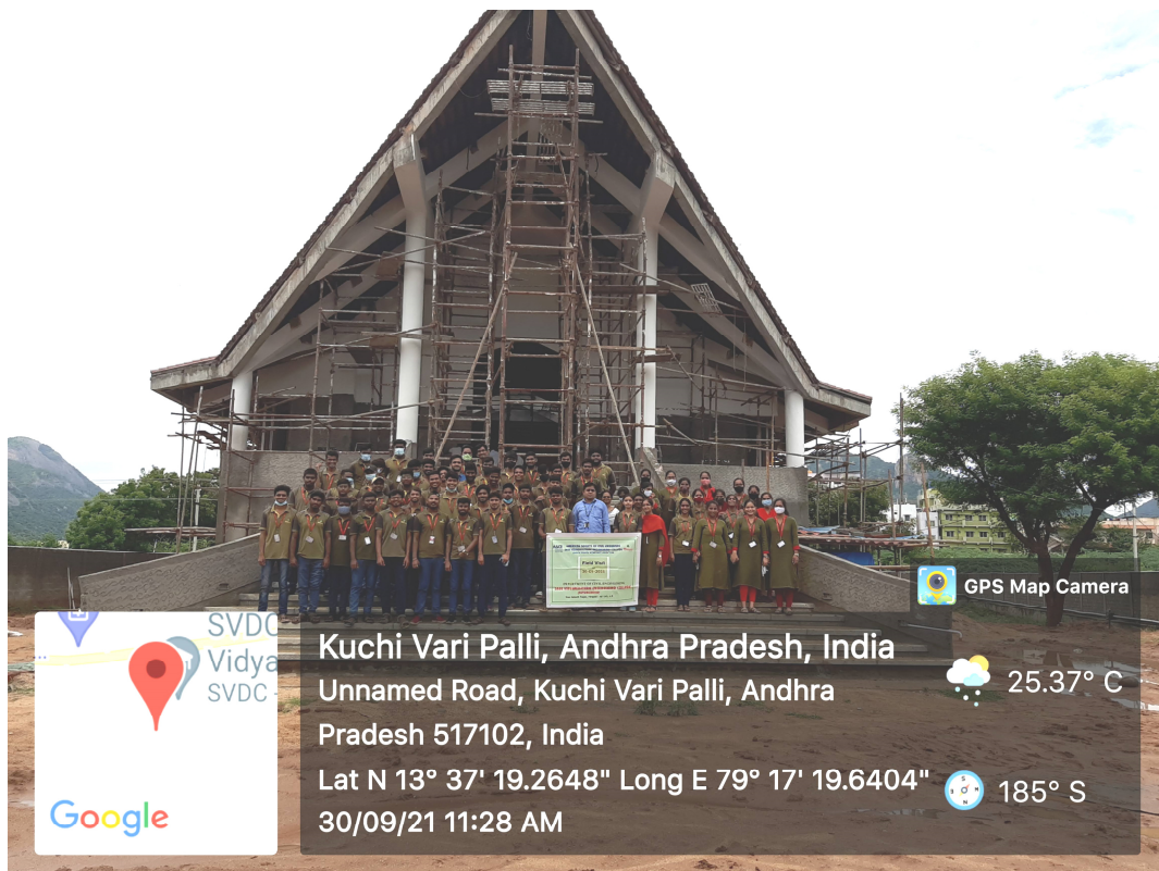
Group Photograph at Construction Site of Sri Shirdi Sai Baba Temple Building, Besides SVEC Campus, A. Rangampet