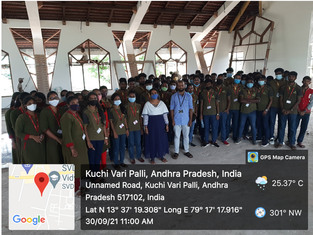
Group Photograph at Construction Site of Sri Shirdi Sai Baba Temple Building, Besides SVEC Campus, A. Rangampet