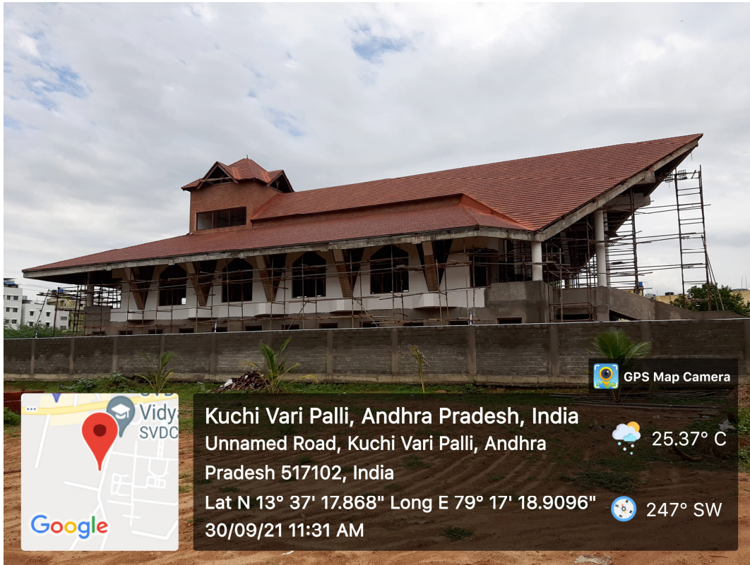
A Photograph at Construction Site of Sri Shirdi Sai Baba Temple Building, Besides SVEC Campus, A. Rangampet