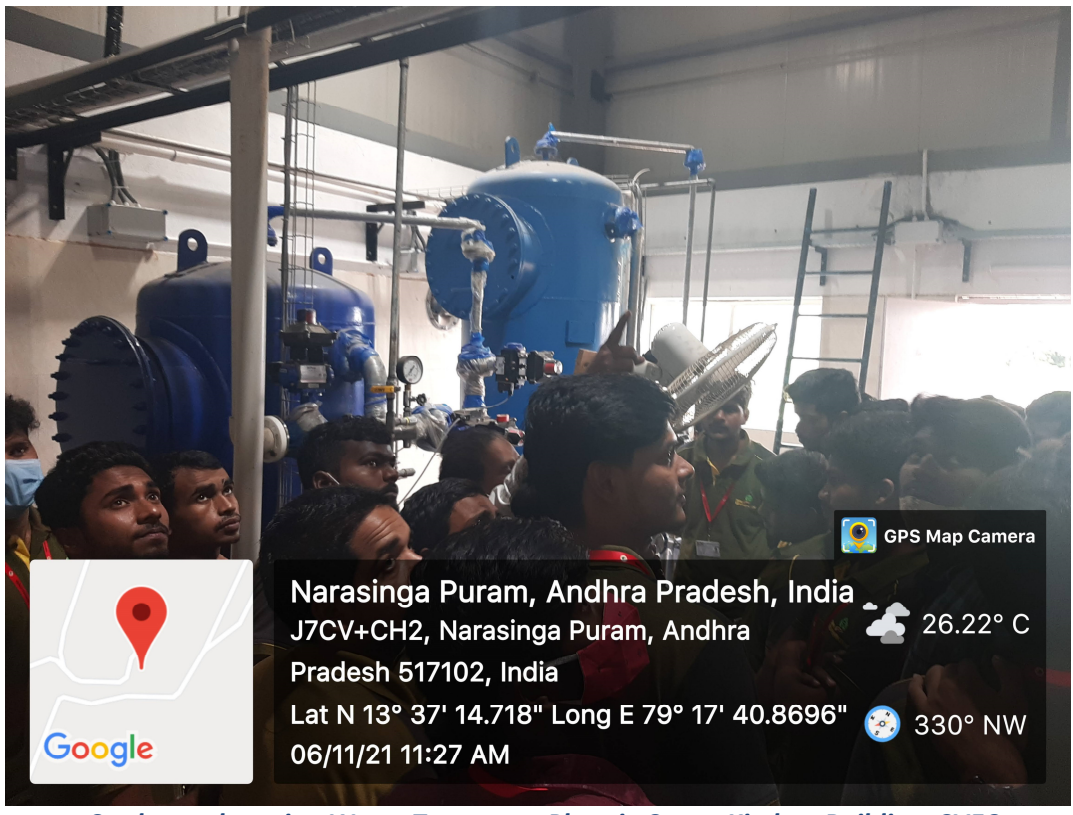
Students observing Water Treatment Plant in Smart Kitchen Building, SVEC

SREE VIDYANIKETHAN ENGINEERING COLLEGE (AUTONOMOUS), Tirupati, Andhra Pradesh – 517102. Call: +91 877-3066900/901/999 ☑@Ividyanikethan [] @@SreeVidyanikethanEngineeringCollegeOfficial ] @@ sreevidyanikethanenggcollege | www.svec.education