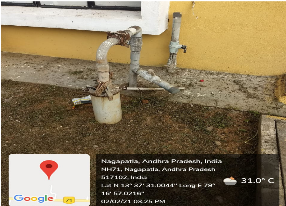
Bore Well-2 at Boys Hostel (6.5" Diameter)