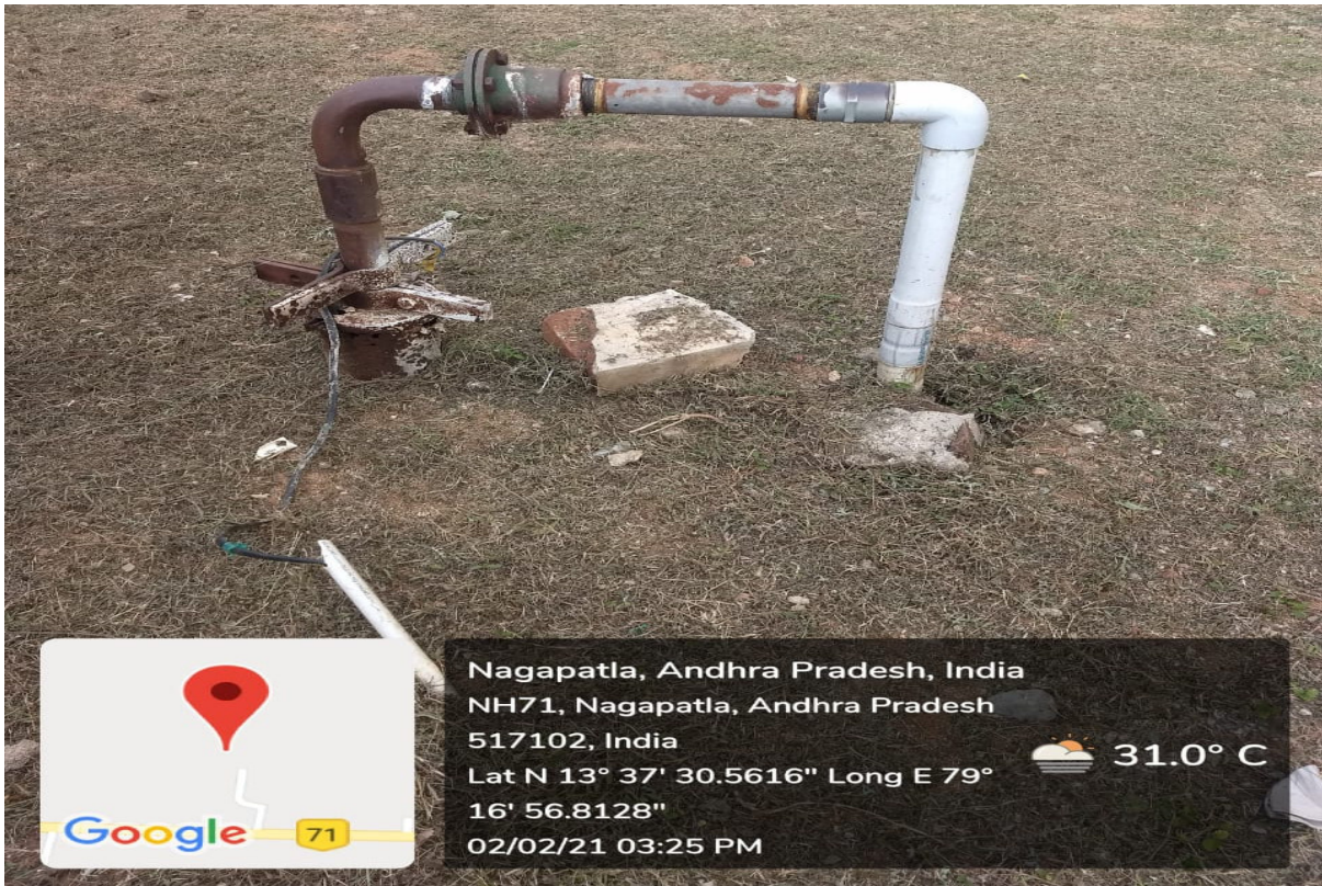
Bore Well-1 at Boys Hostel (8" Diameter)