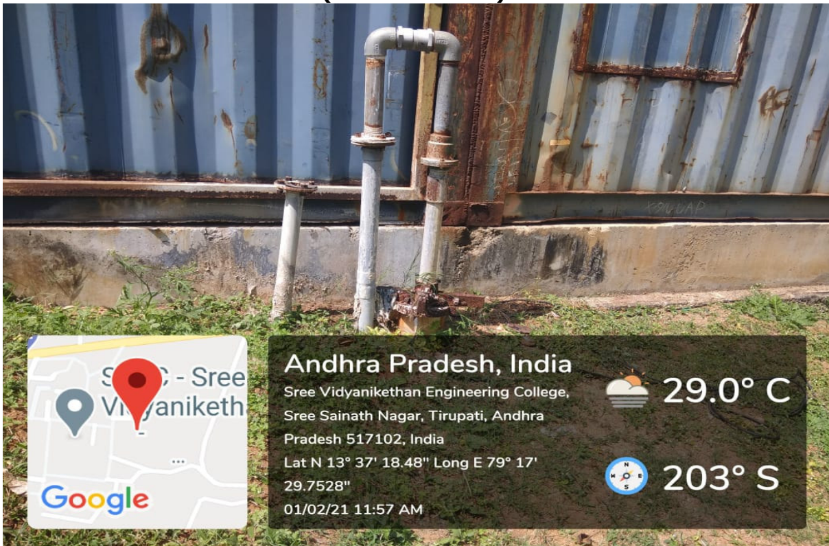
Bore Well near the V Block Main Gate (6.5" Diameter)