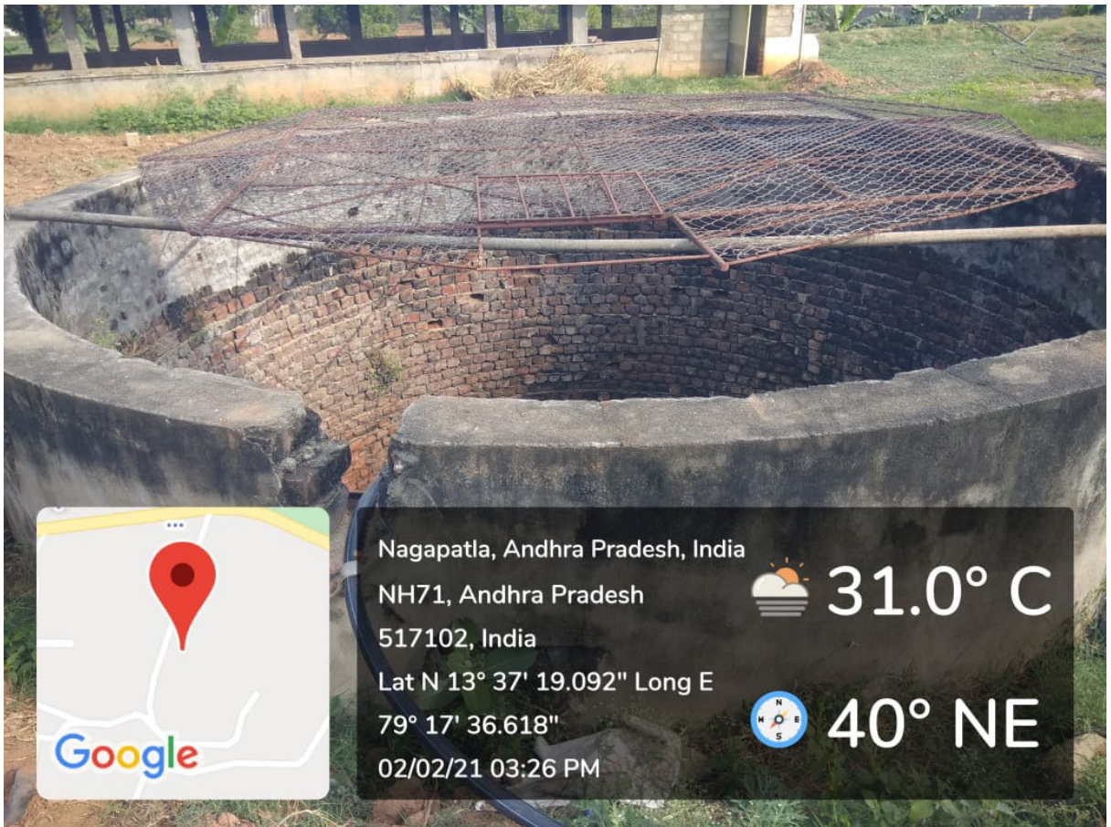
Open Well near V Block (Size: 5.13 m Diameter x 18 m Depth) with Bore (6.5" Diameter)