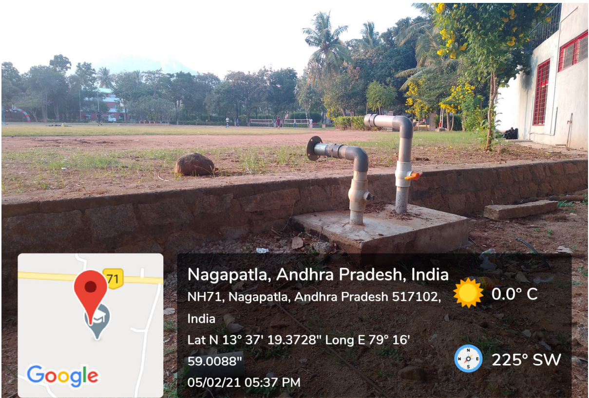
Bore Well-1 at Girls Hostel (8" Diameter)