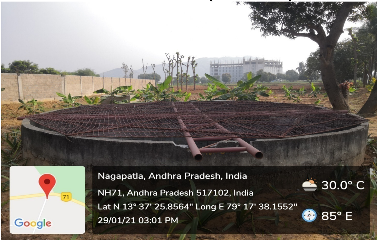
Open Well near the V Block Main Gate (Size: 6.3 m Diameter x 27 m Depth)