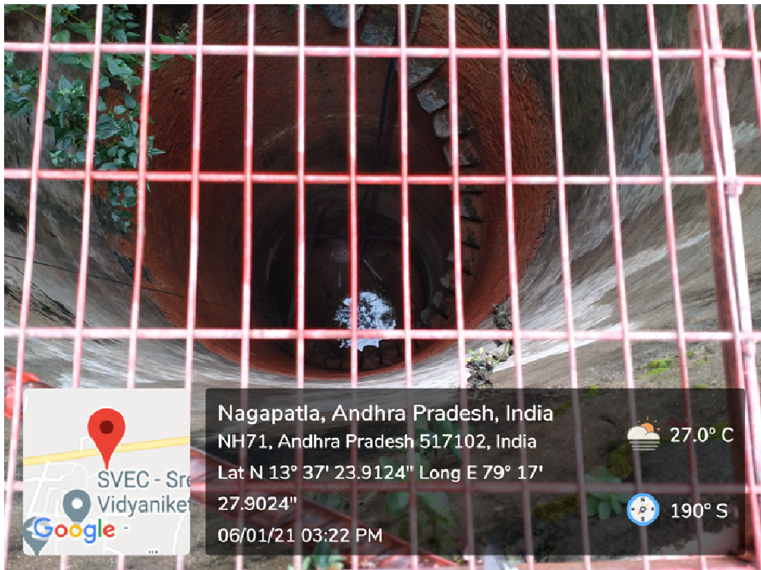
Open Well near Main Gate (Size: 4.3 m Diameter x 20 m Depth) with Bore (6.5" Diameter)