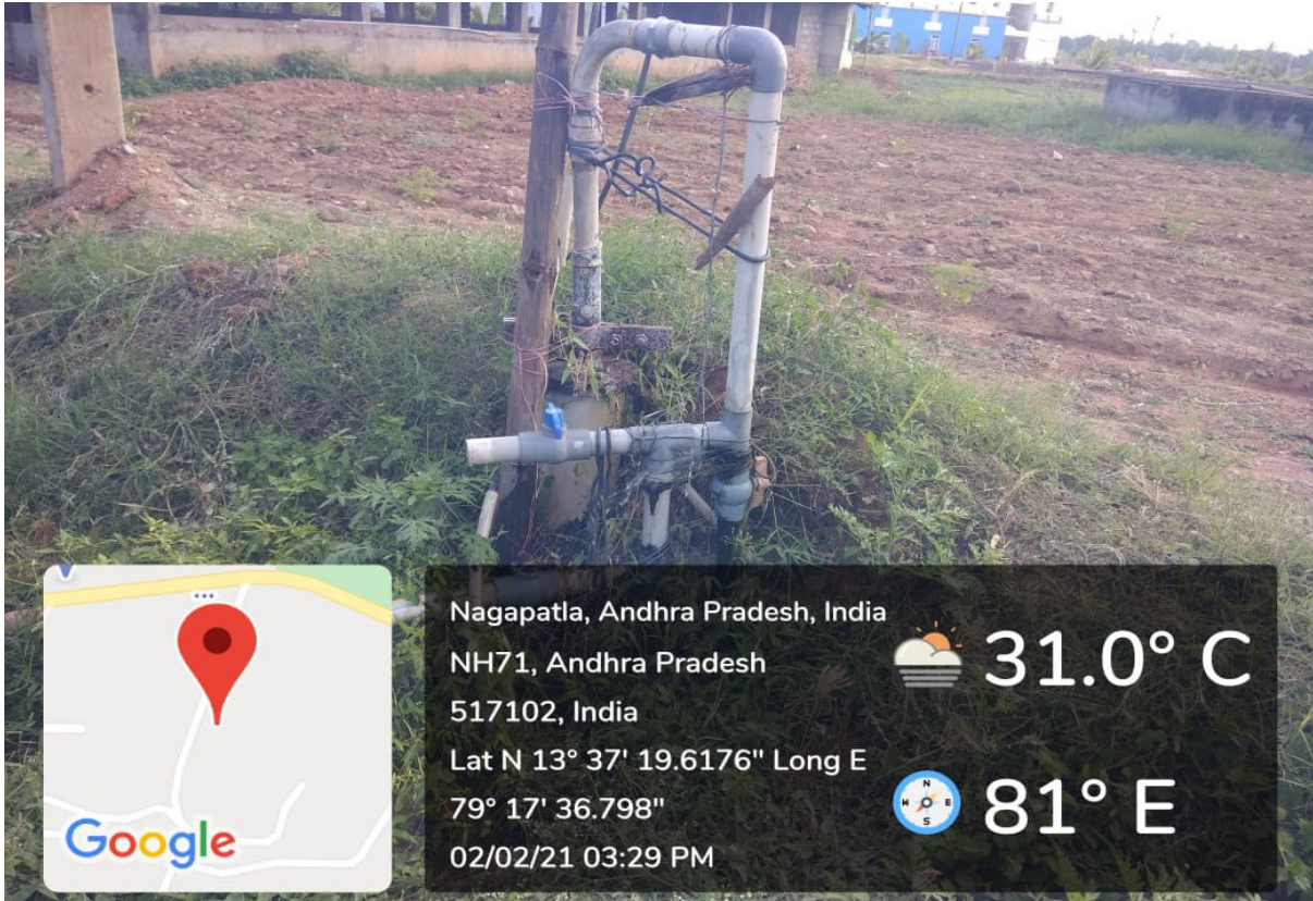
Bore Well near V Block (6.5" Diameter)