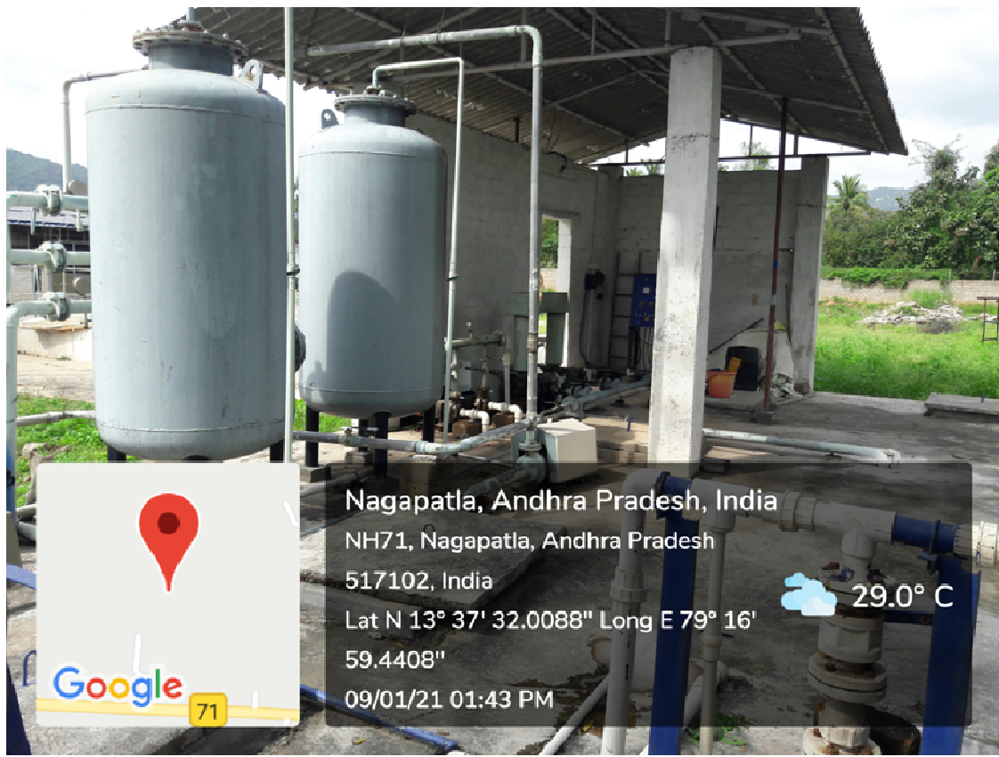
Sewage Treatment Plant of 200 KLD Capacity at Boys Hostels