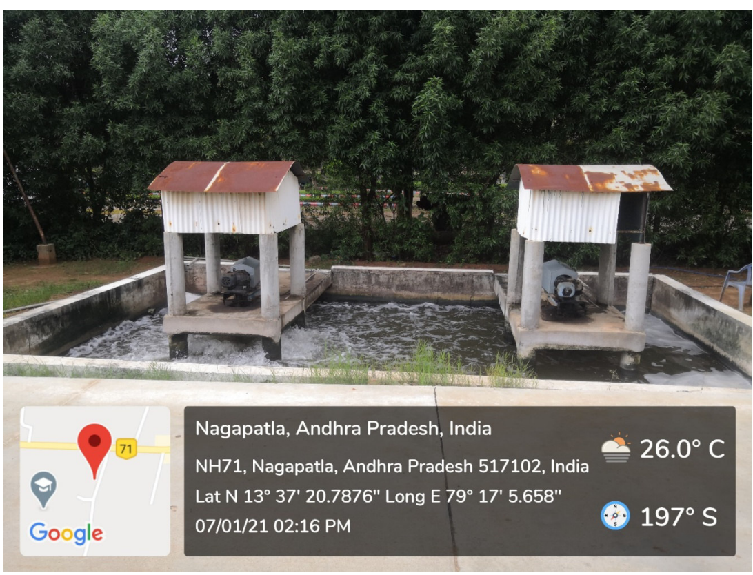
Sewage Treatment Plant of 150 KLD Capacity at Girls Hostels