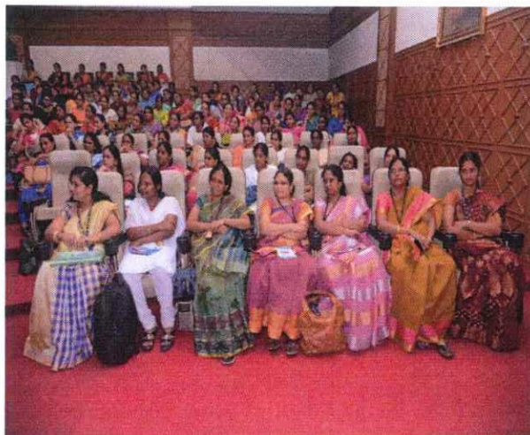
Teachers Day Celebration 2017 at Sree Vidyanikethan Engineering College