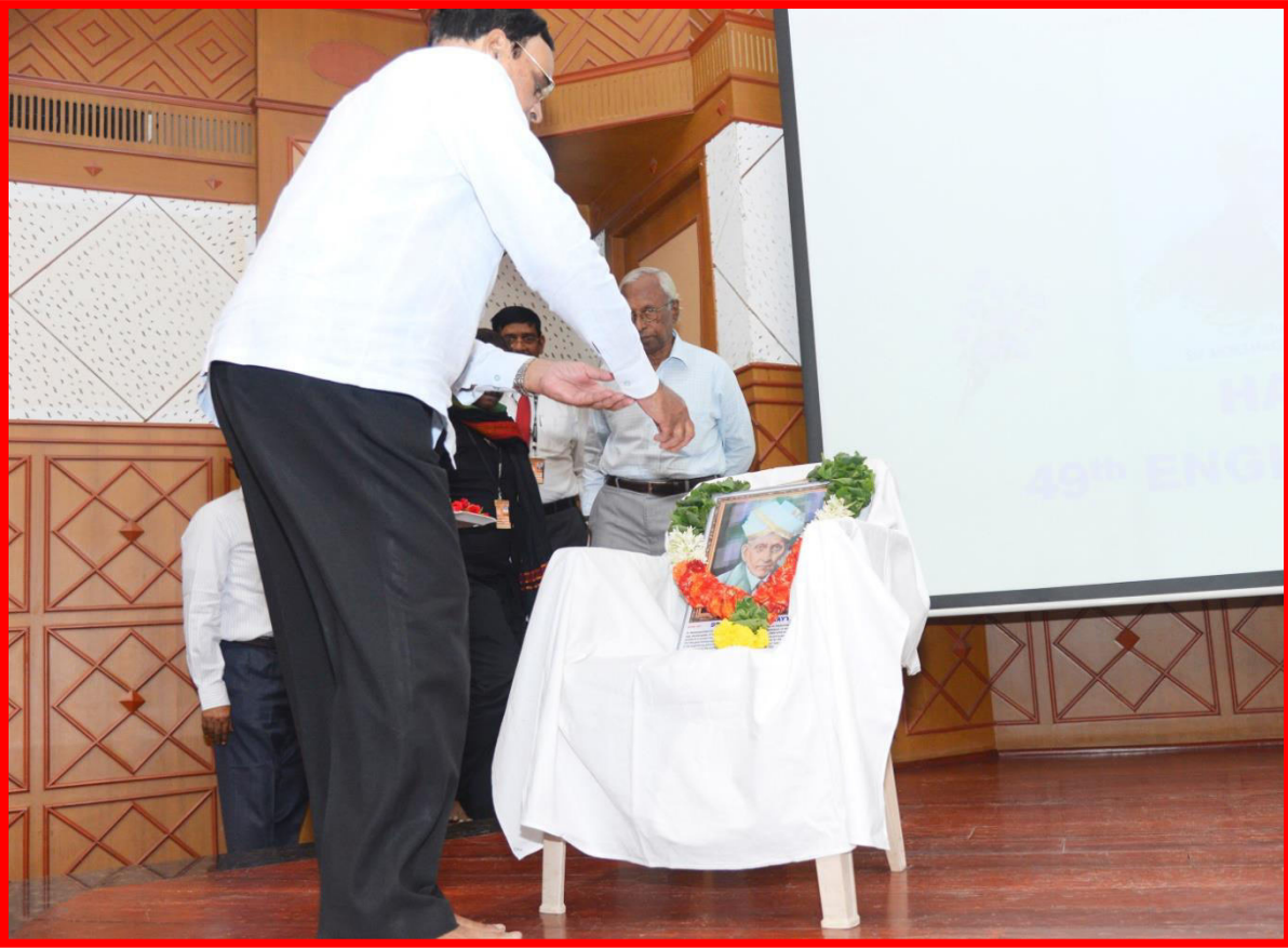
Tributes being paid to Bharat Ratna Sir Mokshagundam Visvesvaraya by the Dignitaries