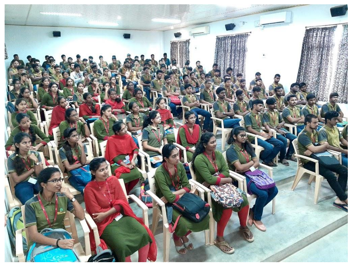
III B.Tech. Civil Engineering Students Listening to the Expert