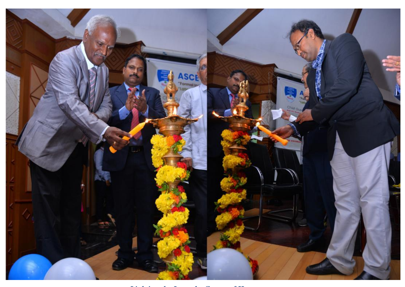
Lighting the Lamp by Guests of Honour