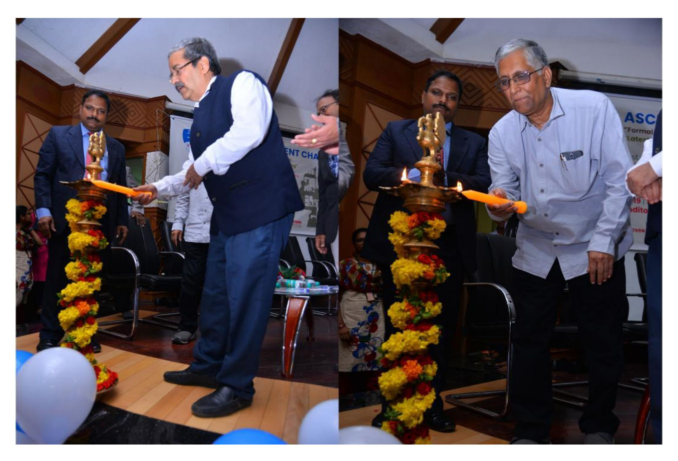
Lighting the Lamp by the Chief Guest and Guest of Honour