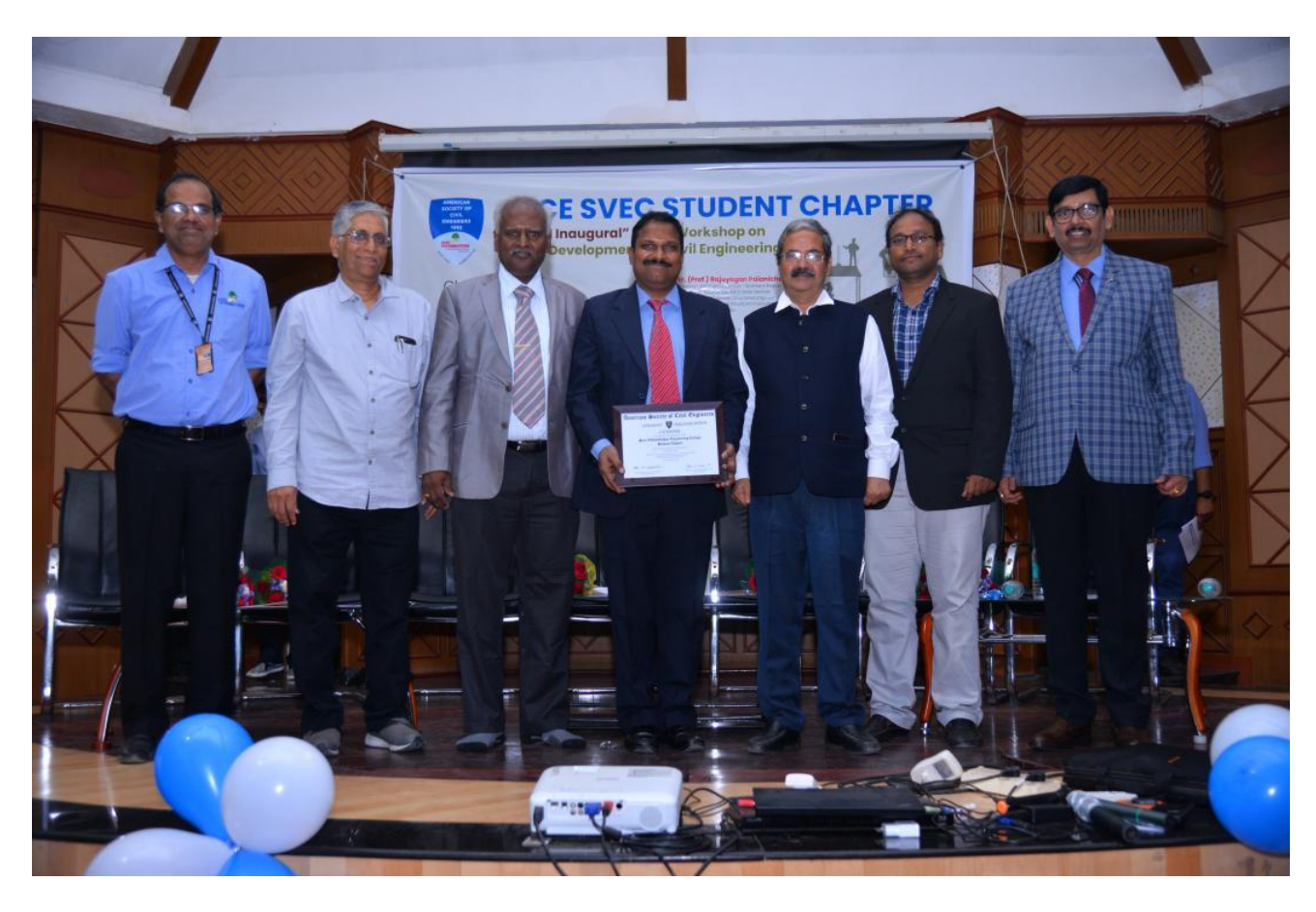
Group Photo with Chief Guest and Guests of Honour