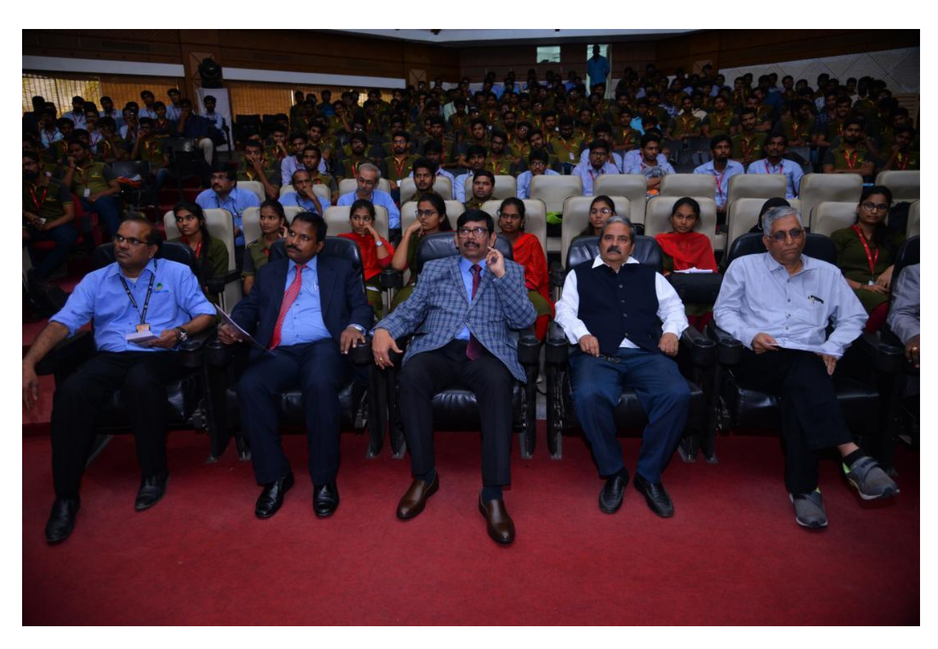
Chief Guest and other Dignitaries during the Inaugural Programme