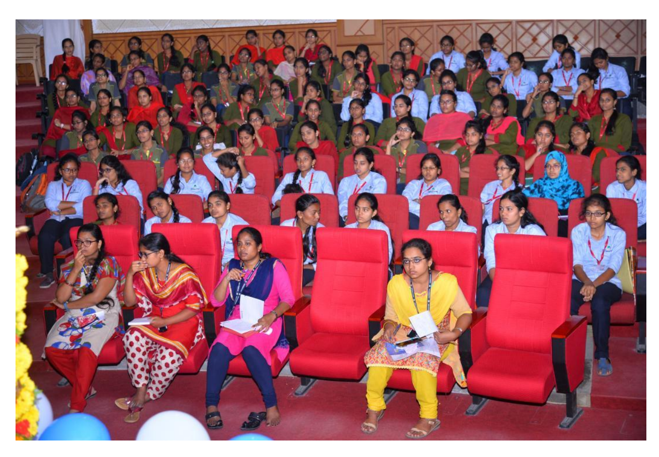
Faculty and Students Listening to the Expert