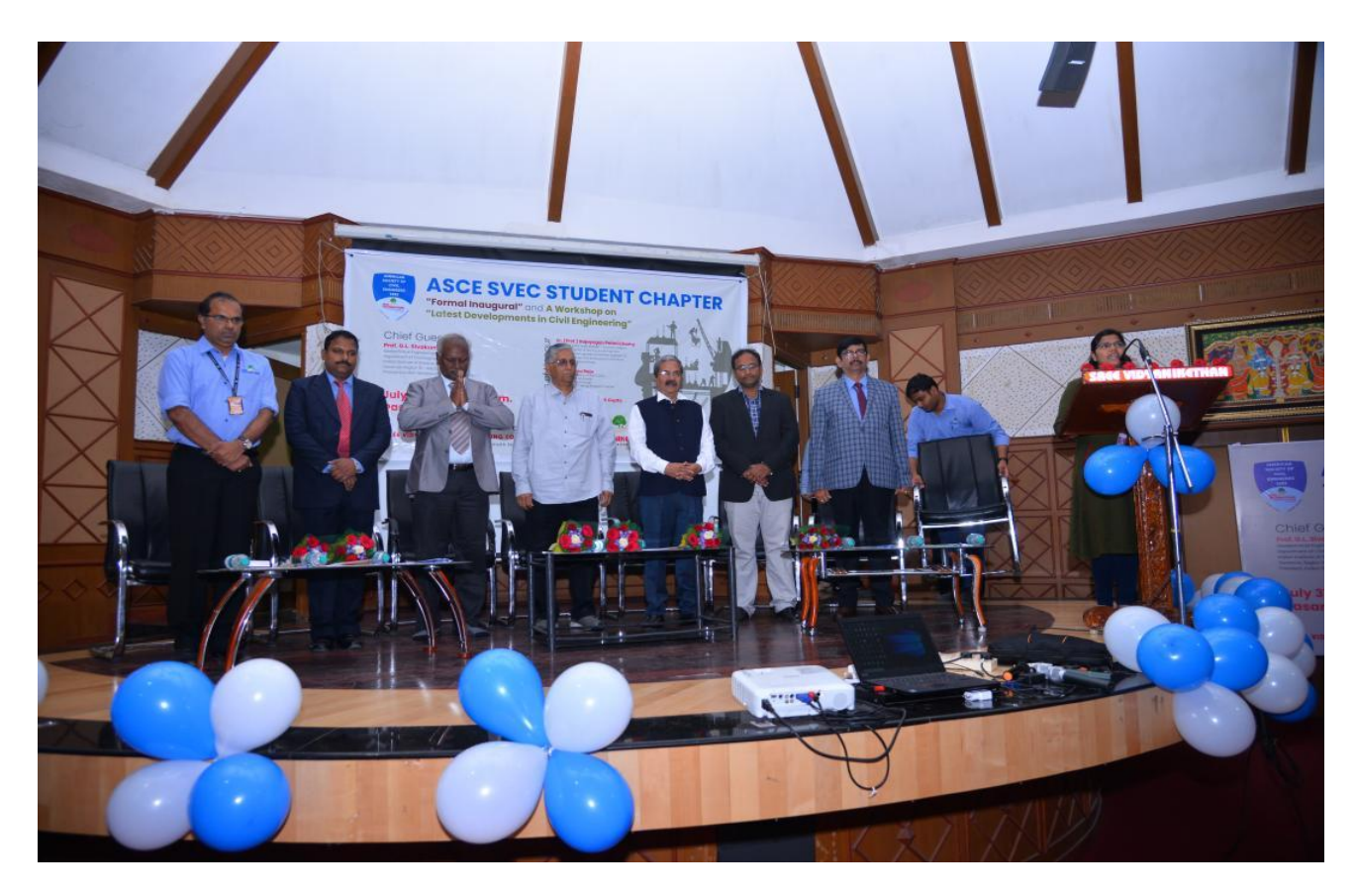
Invocation during the Formal Inaugural