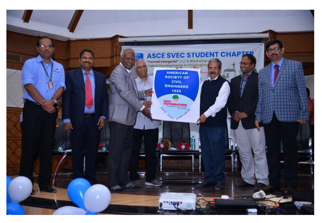
Launching ASCE SVEC Student Chapter Logo