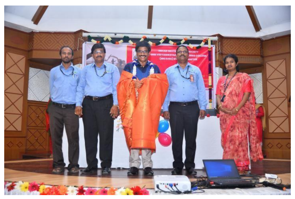
Felicitation to the Chief Guest