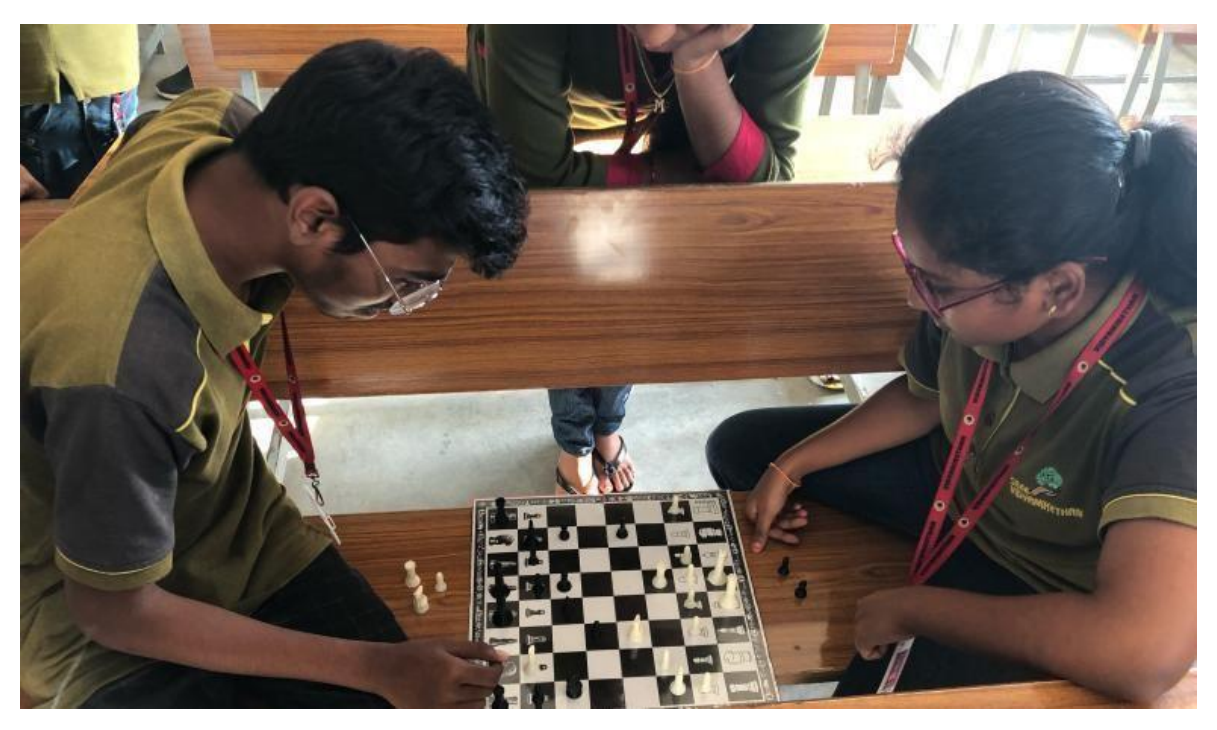
Participation of Students in Chess Competition