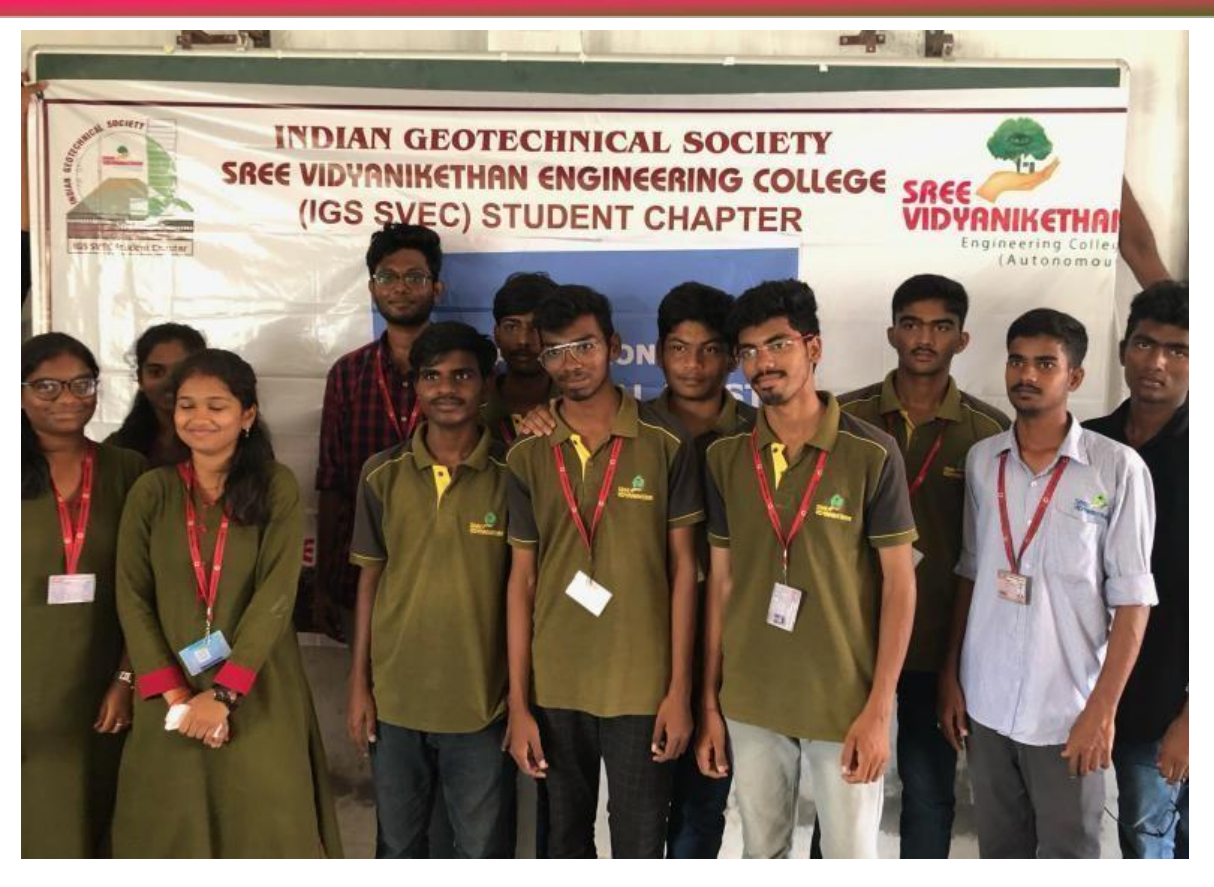
Student Participants in Chess Competition

IGS SVEC Student Chapter Indian Geotechnical Society Sree Vidyanikethan Engineering College (IGS SVEC) Student Chapter