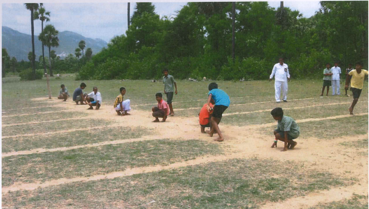
Kotala High School Principal Conducting the Ko Ko –Sport at the School Premises