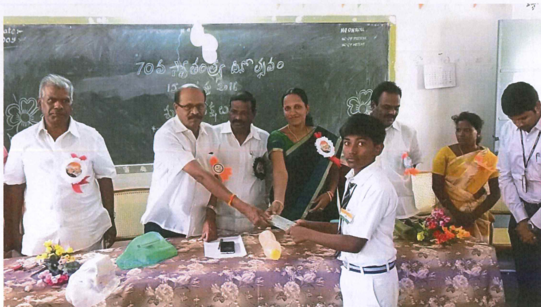
Panchayat Secretary, School Principal and other dignitaries Distributing Prizes to the Students on the occasion of Independence Day