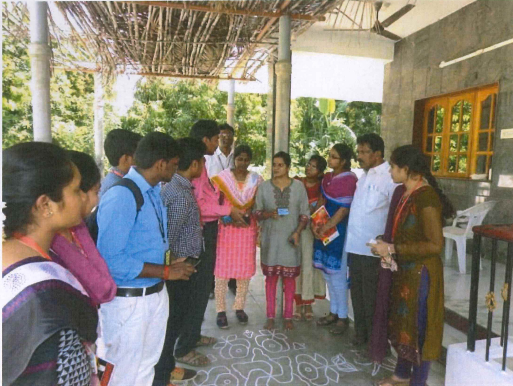
At the Naravarapalli camp: Village Sarpanch, Government officials and Participants.