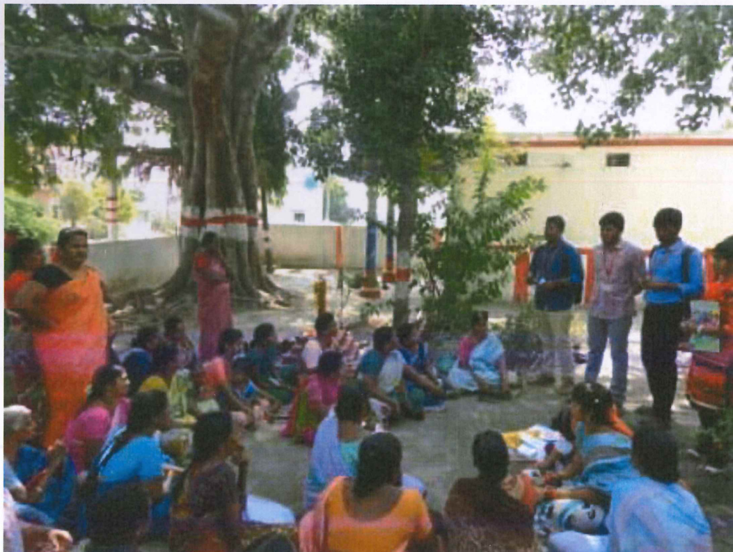
The members of DWCRA being enlightened about cashless transaction at Narsingapuram.