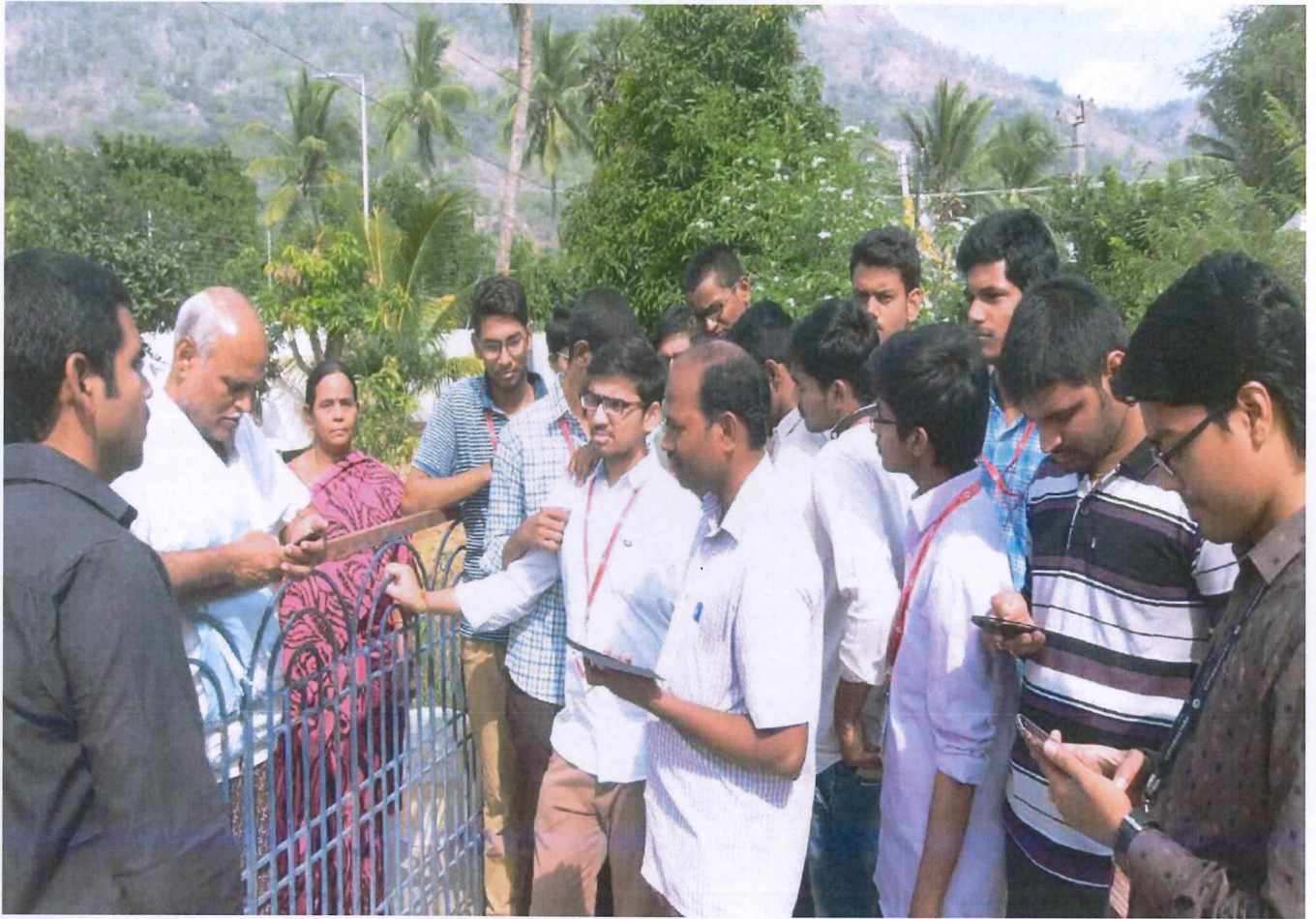
A senior citizen knowing about mobile banking transactions without internet, VRO of Village was accompanied with NSS Volunteers on this occasion