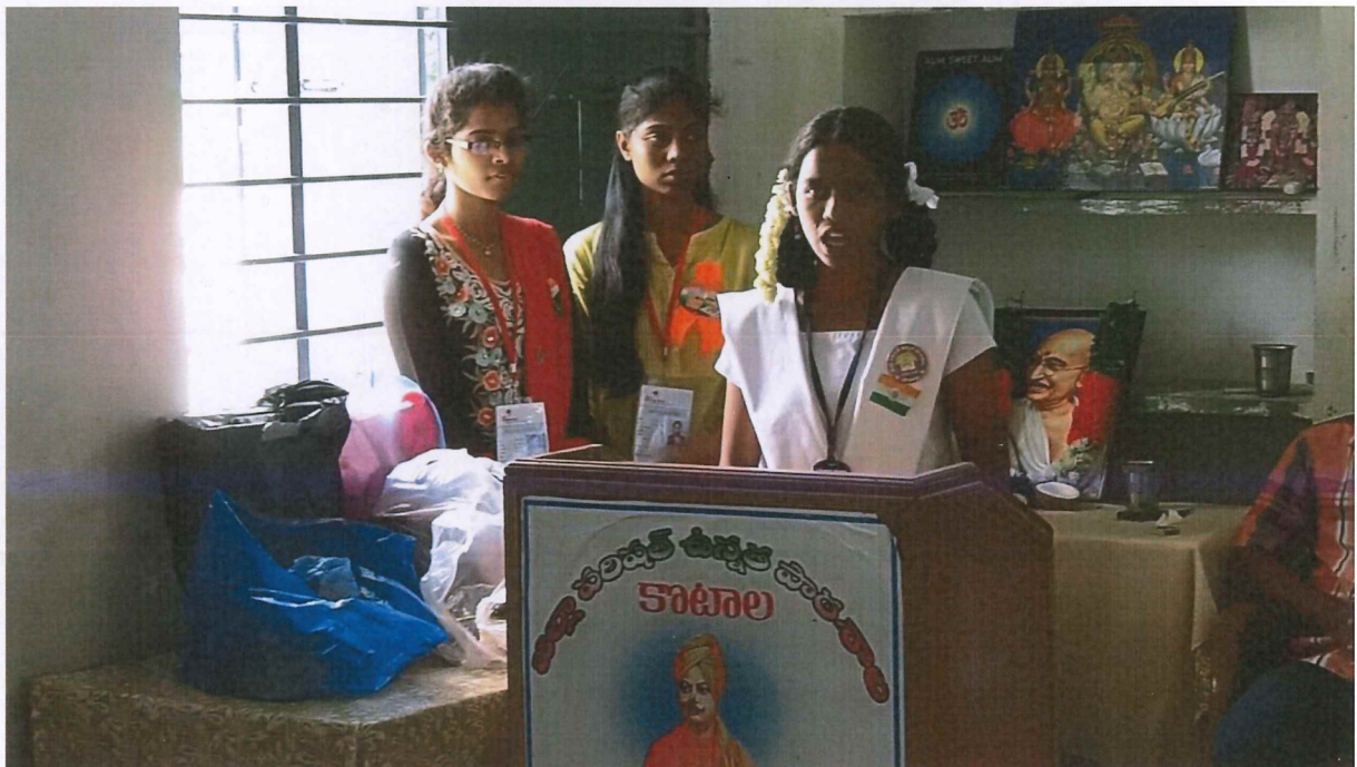
Students Participating in electution Compition at Kotala panchayat High School