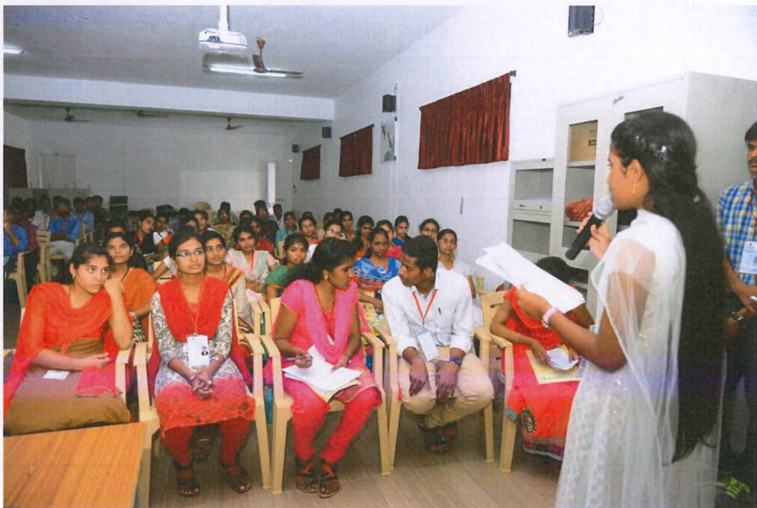
Volunteers sharing their experiences an motivating fellow volunteers during the occasion