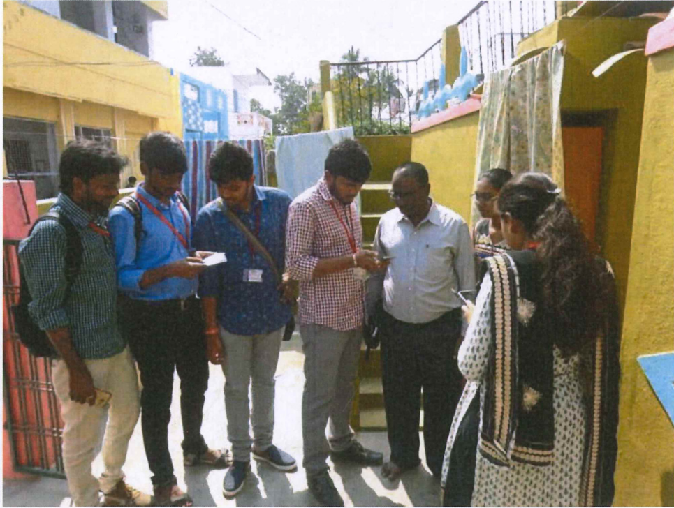
Volunteers installing android apps in villagers' smart phones.