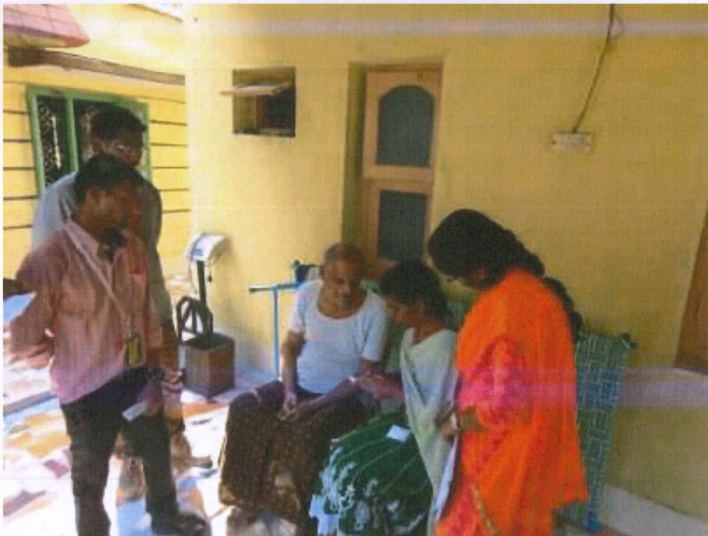
Volunteers explaining cashless transaction to an elderly person at Kandulavaripalli.