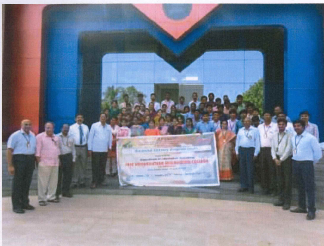
The participants of the campaign along with Sree Vidyanikethan Engineering College Management.