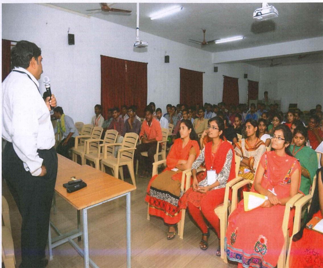
Chief Guest giving the Guest Lecture on "Principles and ethics of Citizen" to the Volunteers