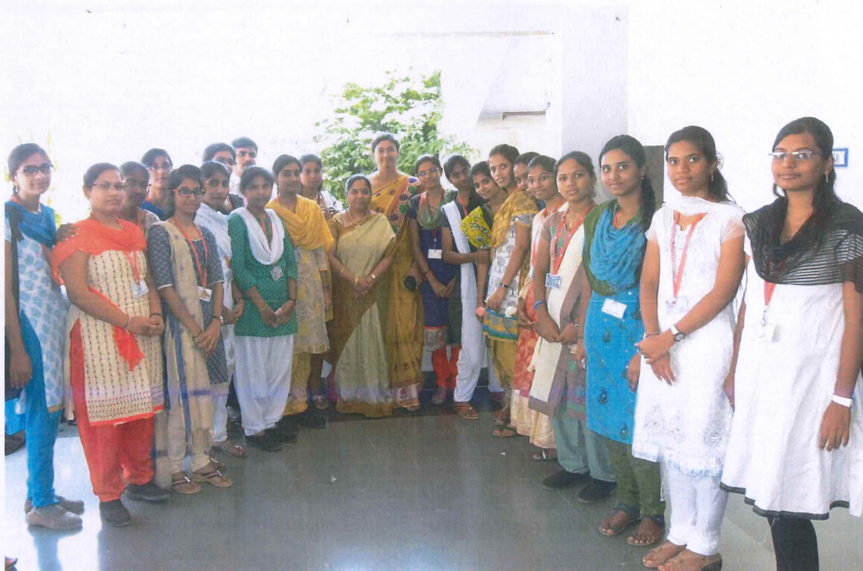
Girl Volunteers along with the Cief Guest at Womens Day Celebrations