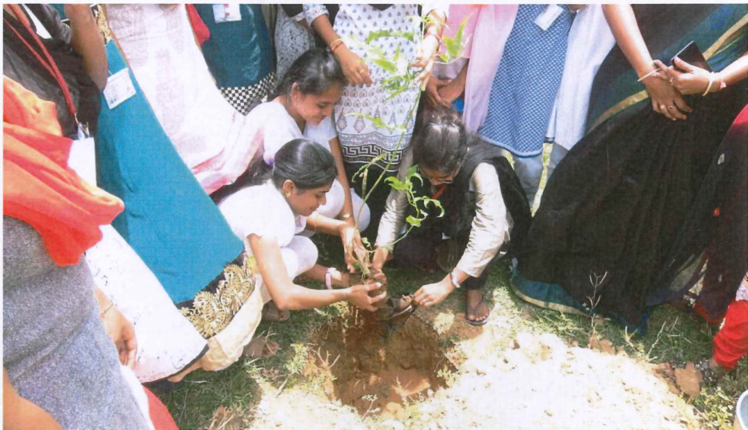
Volunteers Planting Tree Saplings