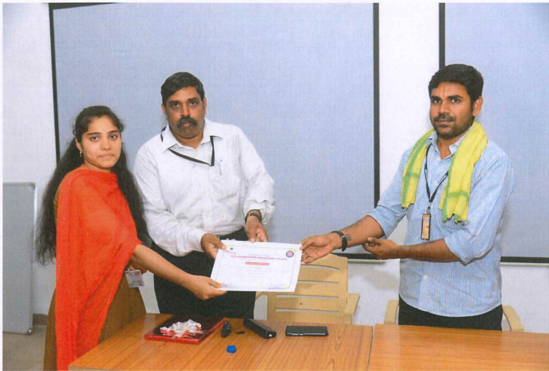
Chiefguest and NSS PO giving away the prizes to volunteers participated in various events