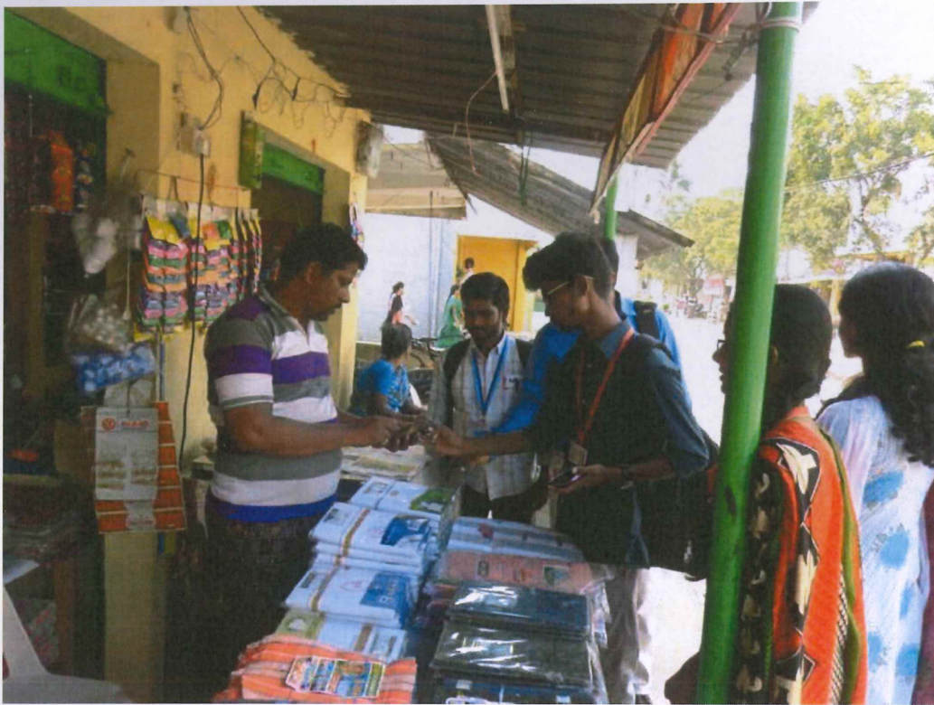
A Shop owner learning internet-based transaction for his business.