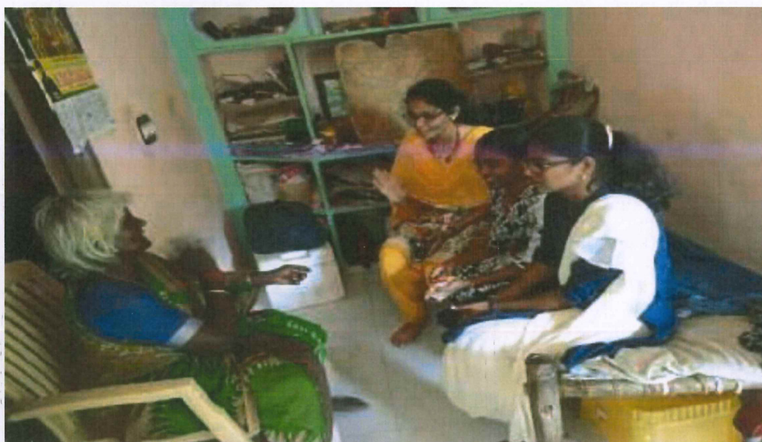
Volunteers interacting with villagers during Door to Door Campaign on Swachh Phakwad