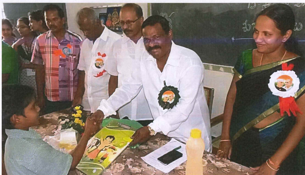
School Principal, Giving away the prizes to the children having best academic performance