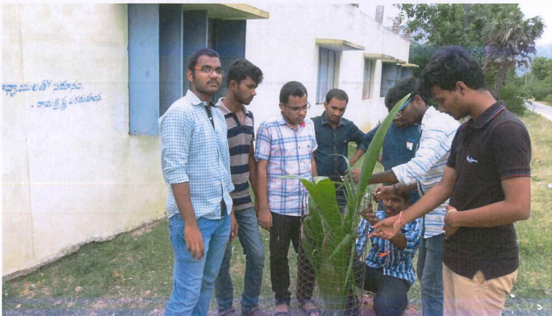
Volunteers lying fencing to the tree saplings planted near Panchayat Office of Kotala Panchayath