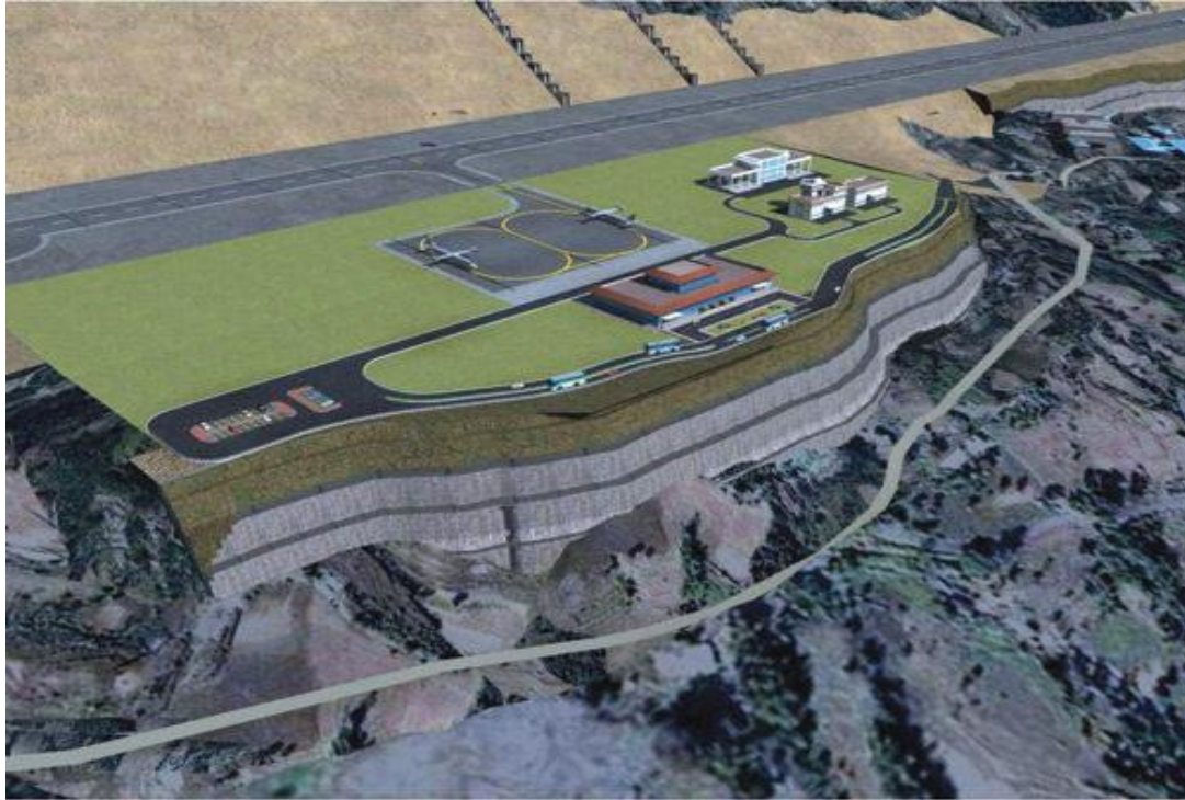
Photograph of Pakyong Airport Proposed View as Part of Presentation