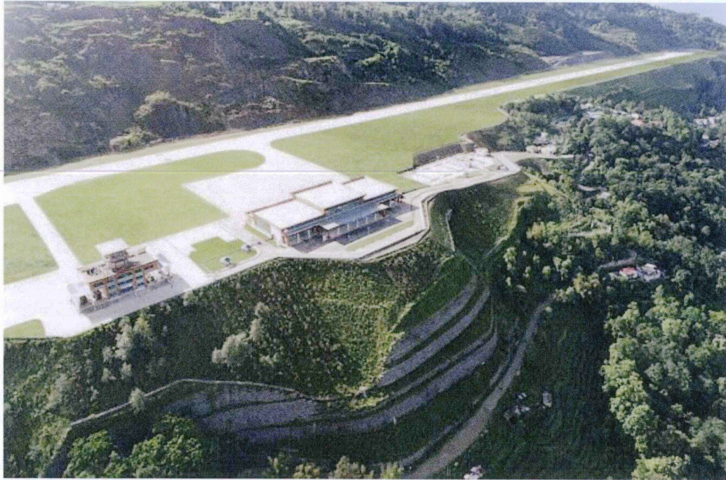
Photograph of Pakyong Airport After Construction View as Part of Presentation