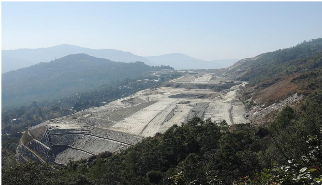
Photograph of Pakyong Airport Under Construction View as Part of Presentation