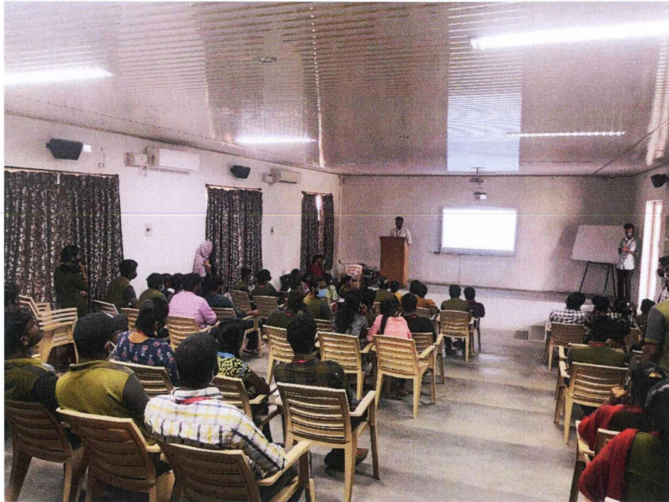
Participants during Quiz Competition