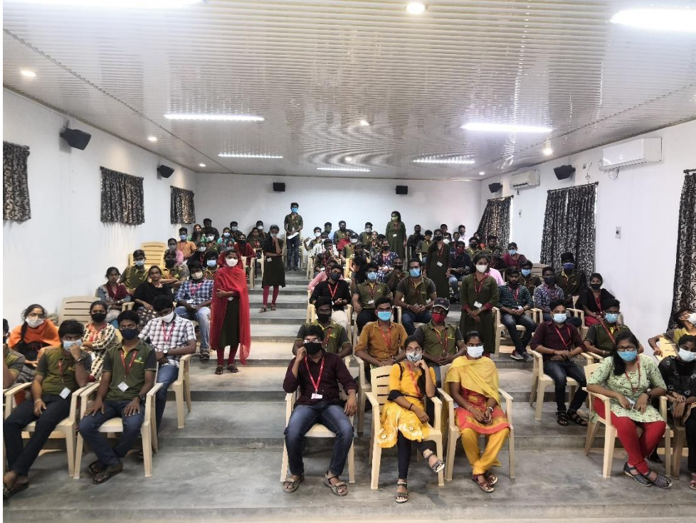
Students gathered for General and Technical Quiz