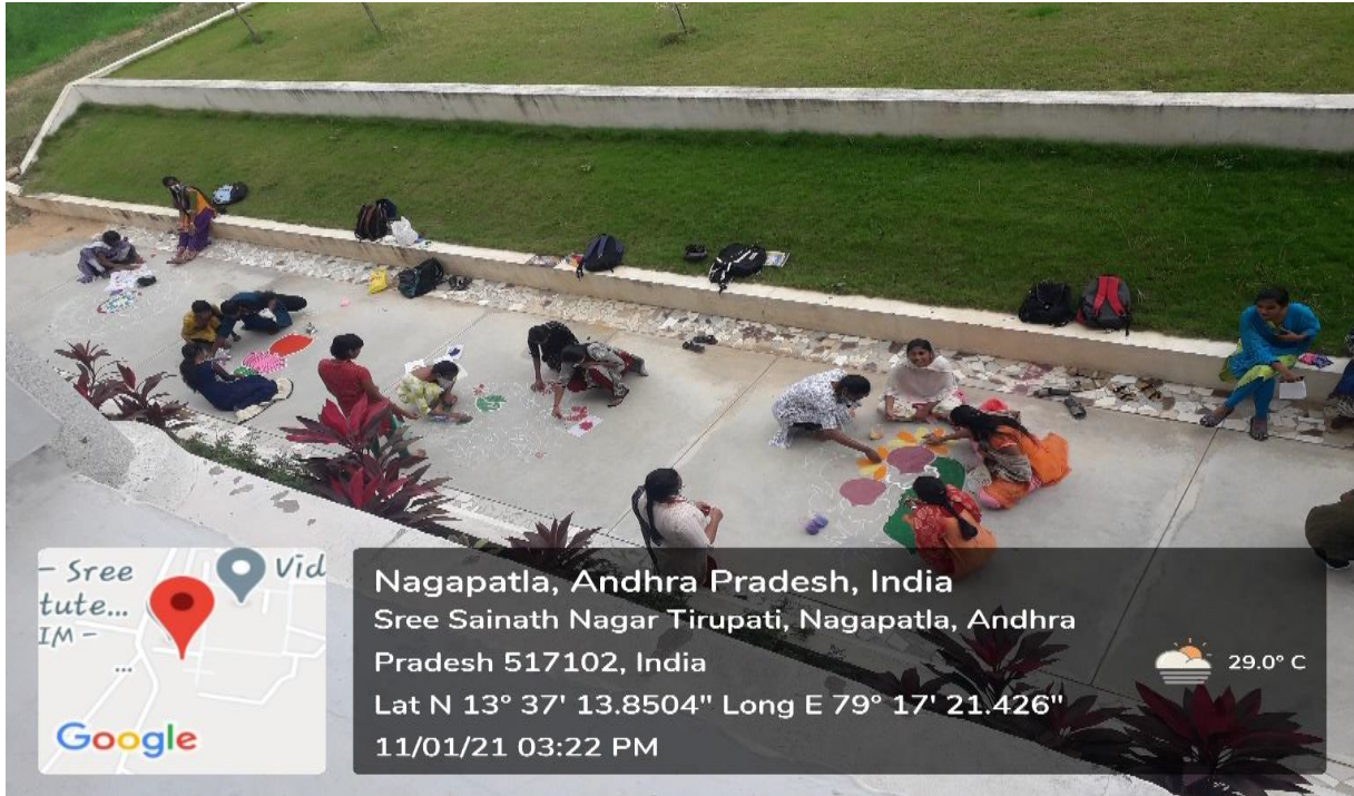
Rangoli by Teams T 1 , T 2 , T 3 , T 4