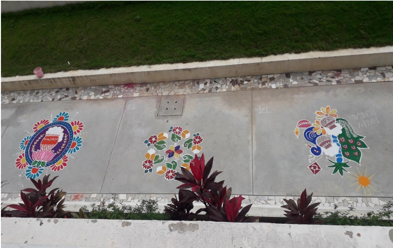
Rangoli by Teams T 2 , T 3 , T 4

The Photographs of the event are as follows: