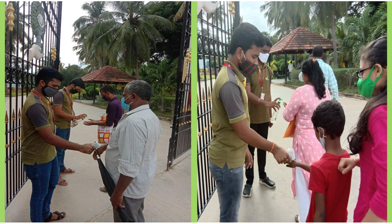
ASCE SVEC Student Chapter Office Bearers of Civil Engineering Department in the Community Service on "Safety Measures to Prevent COVID-19", A. Rangampet, Chandragiri Mandal, Chittoor District, A.P, India