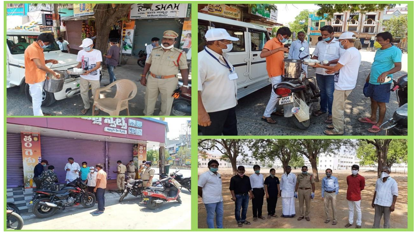
ASCE SVEC Student Chapter Office Bearers of Civil Engineering Department in the Community Service during COVID-19 Lockdown in India