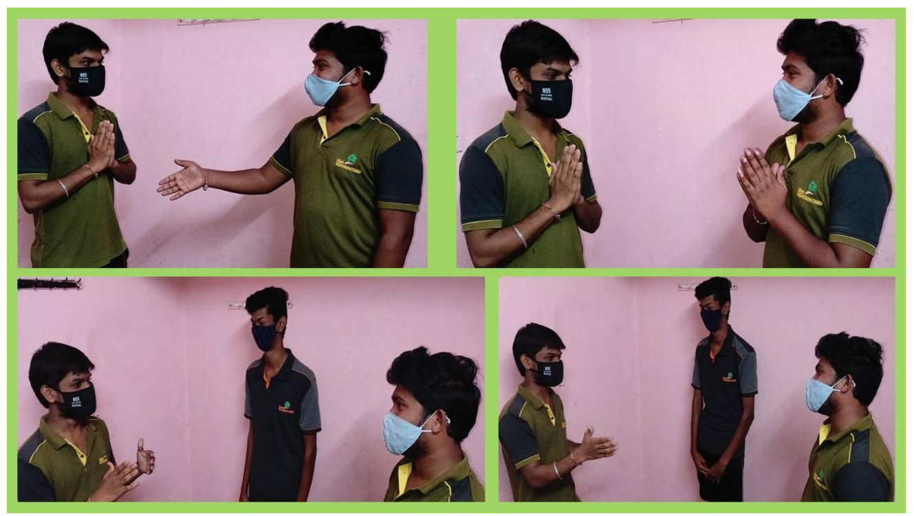
ASCE SVEC Student Chapter Office Bearers of Civil Engineering Department in the Community Service on "Safety Measures to Prevent COVID-19", A. Rangampet, Chandragiri Mandal, Chittoor District, A.P., India