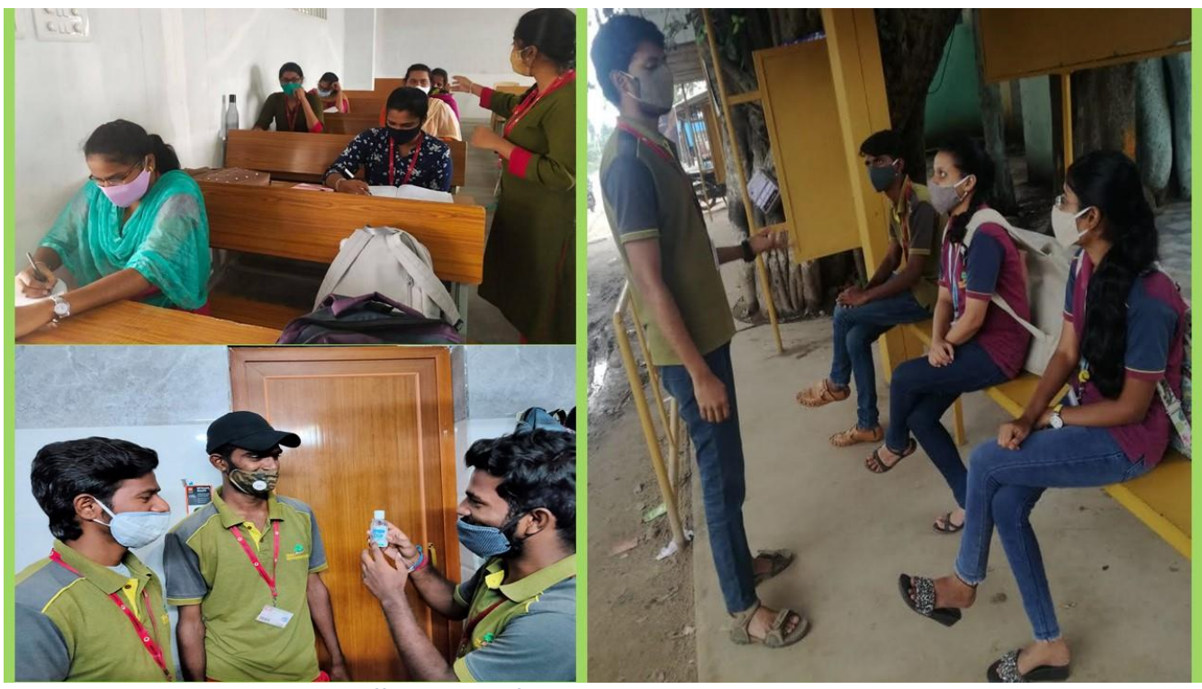
ASCE SVEC Student Chapter Office Bearers of Civil Engineering Department in the Community Service on "Safety Measures to Prevent COVID-19", A. Rangampet, Chandragiri Mandal, Chittoor District, A.P, India