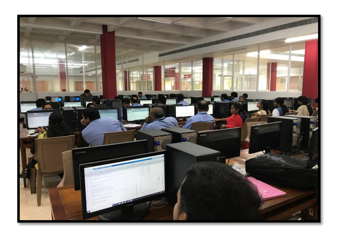
Cross section of participants