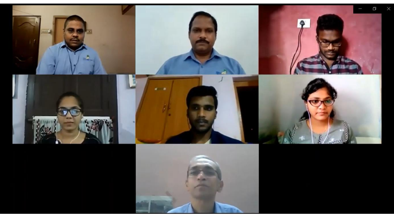
Faculty and Students are interacting with the Speaker