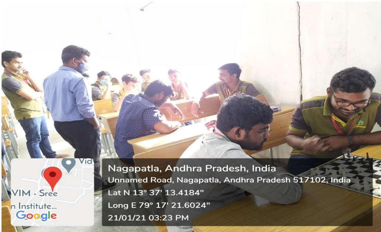
III B.Tech. CE students Participation in Chess Competition