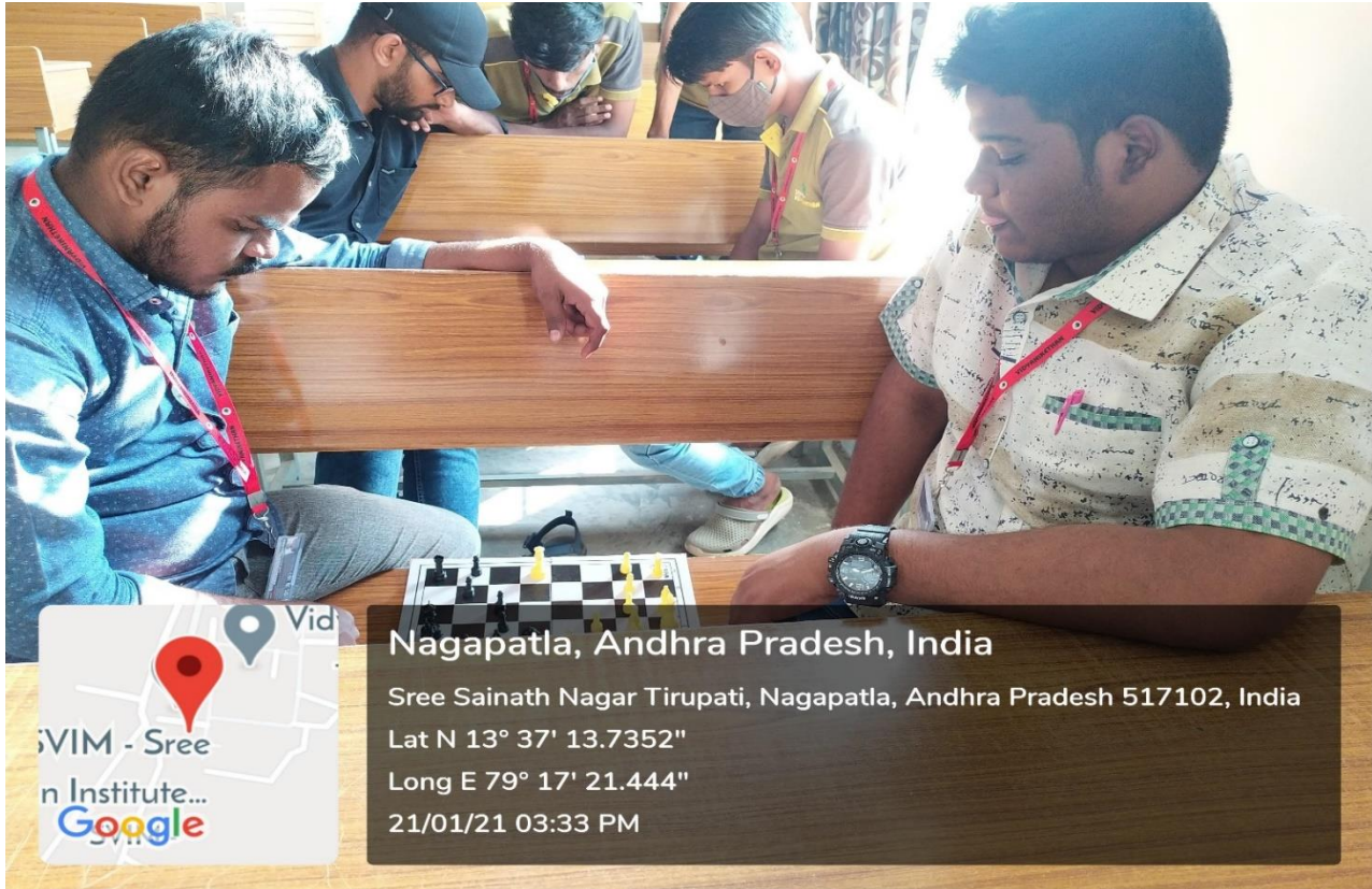
III B.Tech. CE Students Participation in the Competition