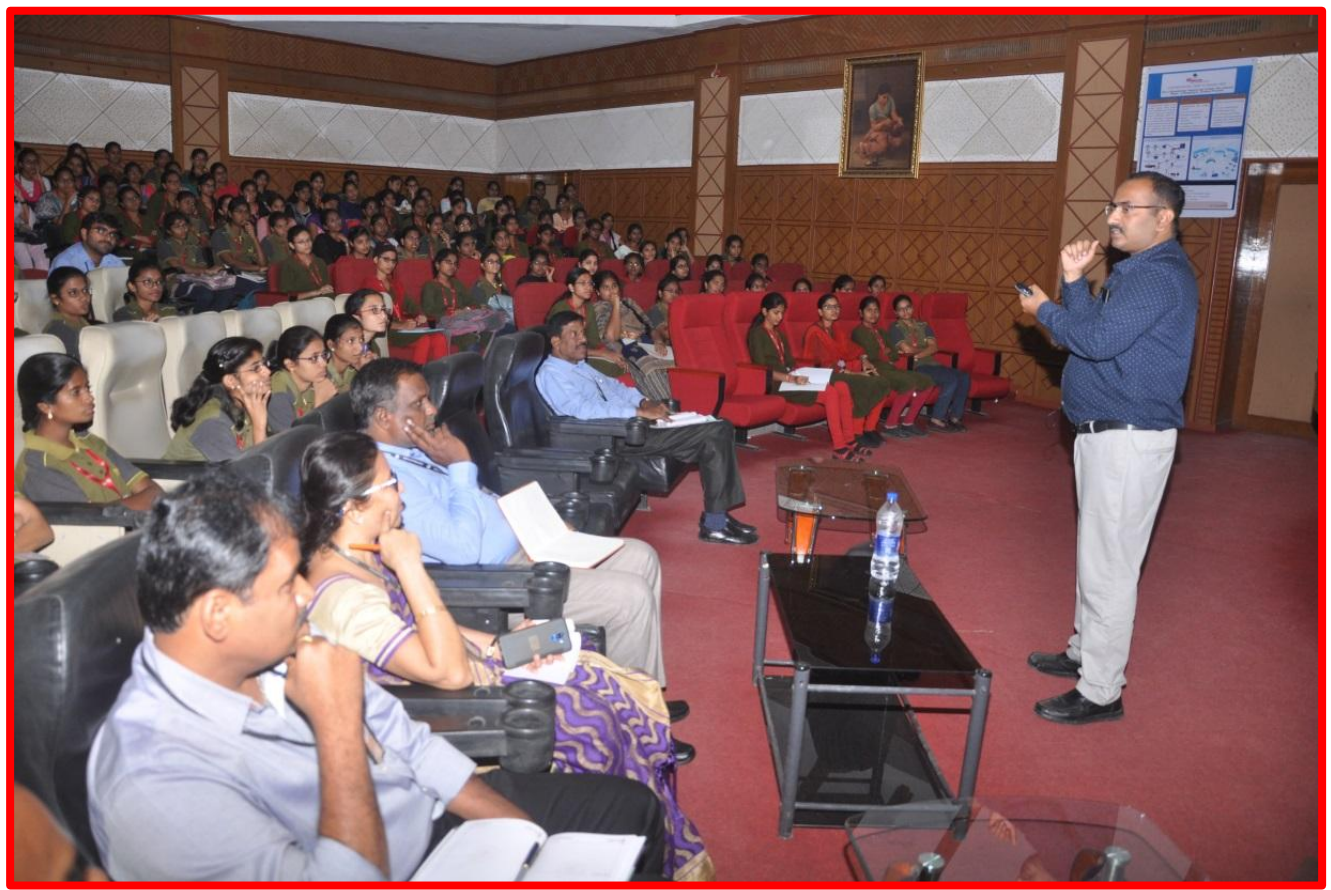
Students, Faculty and Staff Practicing in Expert Lecture

He mentioned the Power Purchase Agreements (PPA) of Reliance Power and TATA Power in India.