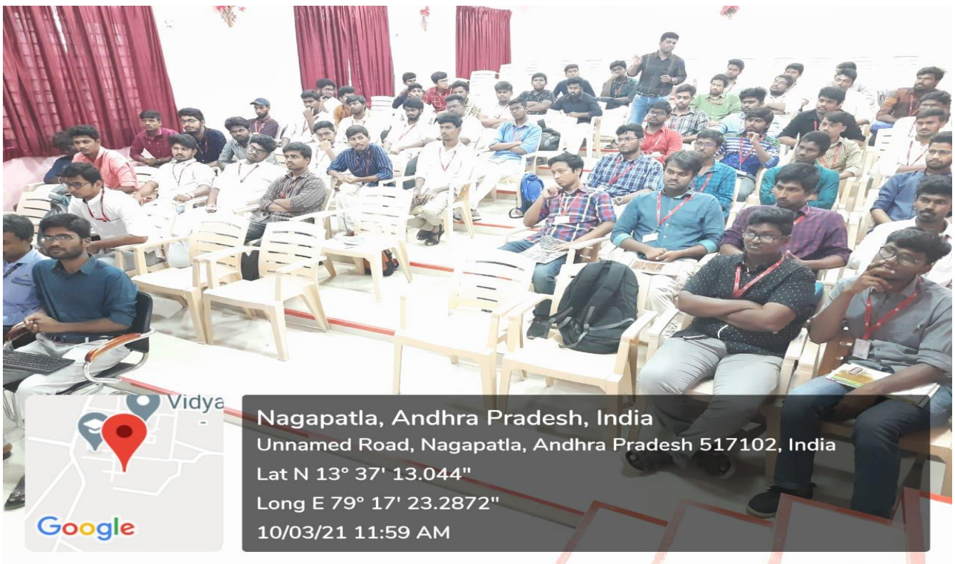
Students during the expert talk