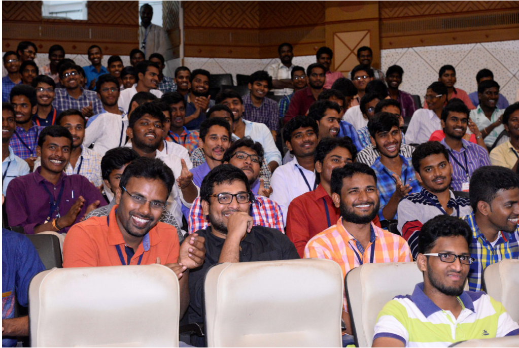
Alumni, enjoying the occasion.