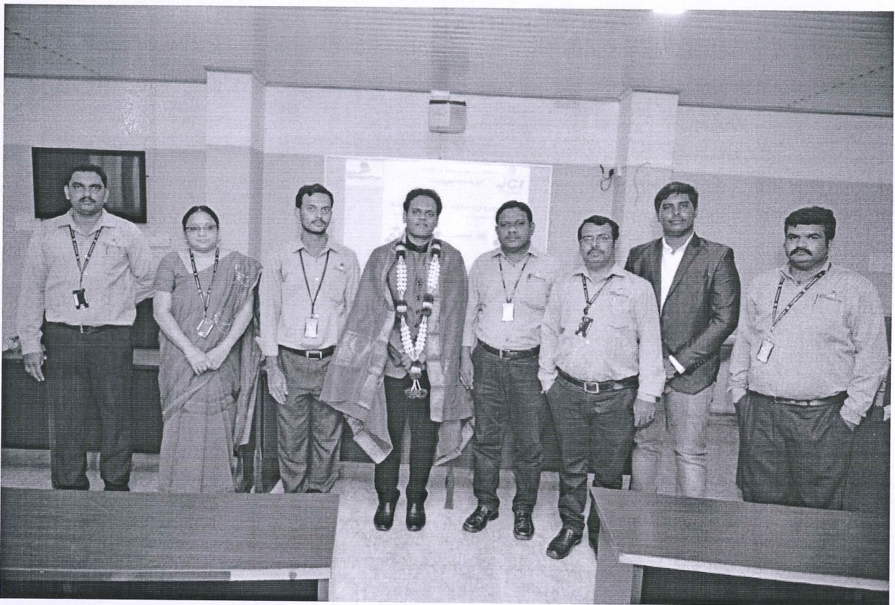
Felicitation to the chief Guest by Coordinators, during Inauguration