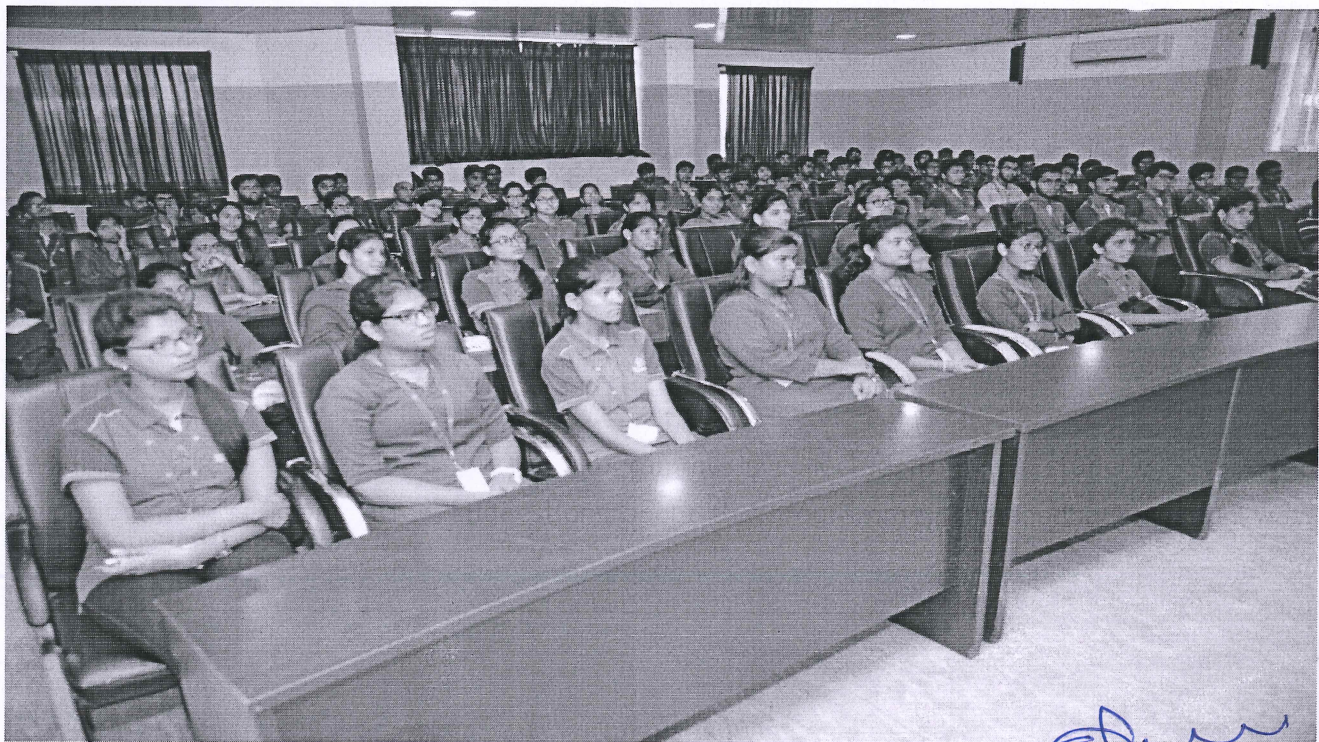
Participation of students during the programme

In the afternoon, feedback on the programme is collected from the students. Students gave positive feedback and a few suggestions about the programme. The feedback session was followed by valedictory function.