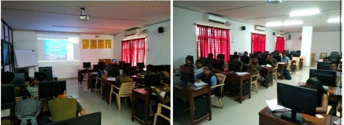
Figure 2. Students participating in ARC1.0 Online sessions

3.0 courses for 3 months training for each of the course. APSSDC and ECM are jointly sponsoring 90% of the course fee, offering a one of its kind high end robotics skills courses to the students at a very marginal cost.