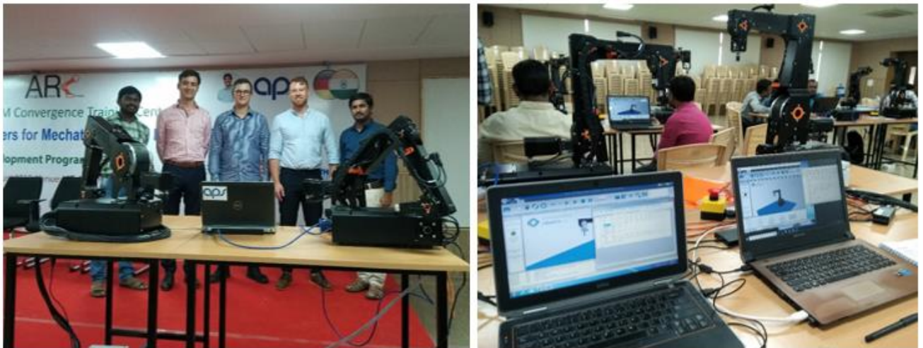
Fig.1 ARC offline training